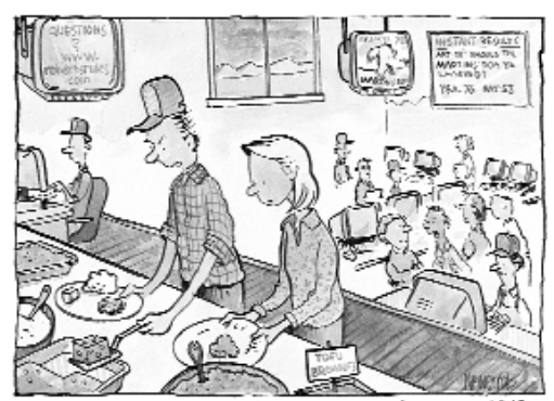
"TOWN MEETING MAY HAVE TAKEN A BIG TECHNOLOGICAL LEAP, BUT THE MARSHMALLOW DELLO HASN'T."

k) After the vote is announced, the moderator moves to the next article on the agenda by reading it to the assembly. If a voter interrupts this reading by moving to reconsider the prior vote, the moderator must stop his reading and ask if there is a second to the motion to reconsider. The meeting may only reconsider a vote once before going to the next item on the agenda.