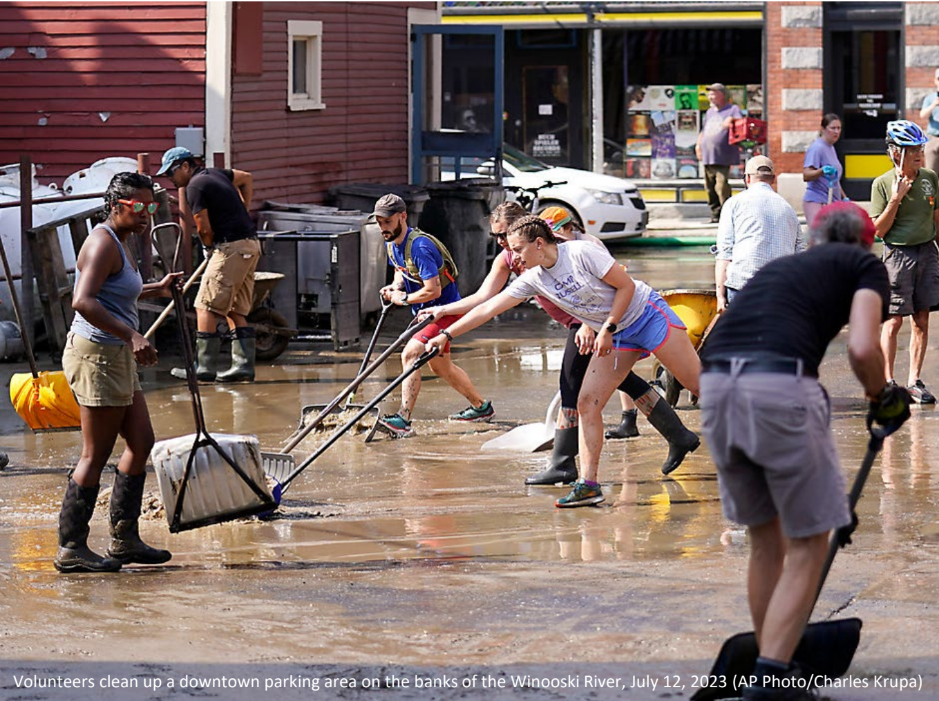
Volunteers clean up a downtown parking area on the banks of the Winooski River, July 12, 2023