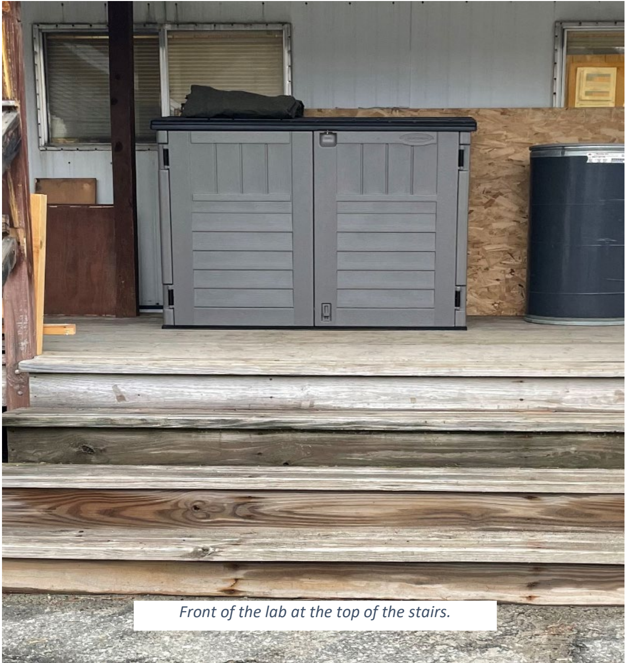
Front of the lab at the top of the stairs.