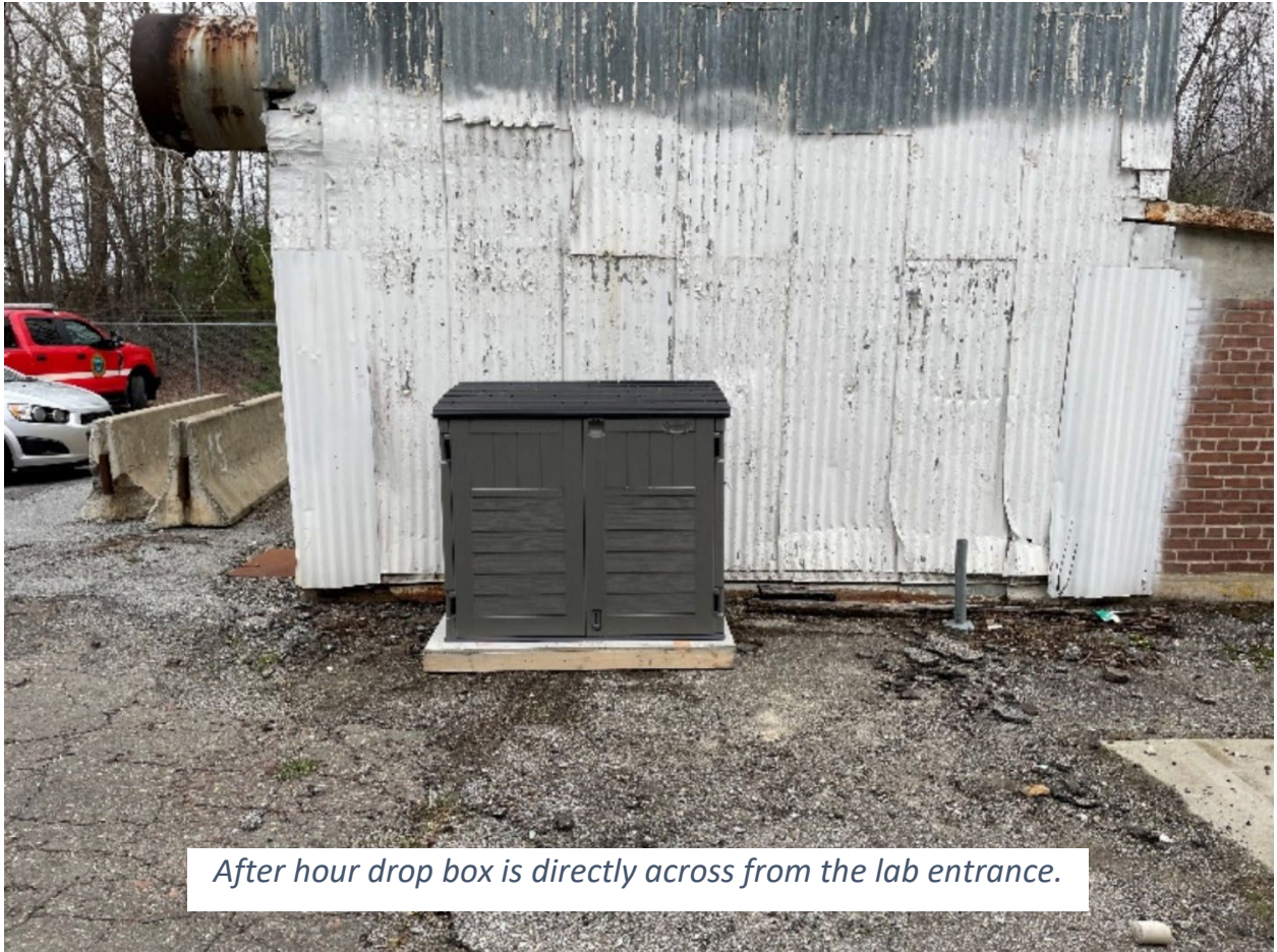
After hour drop box is directly across from the lab entrance.