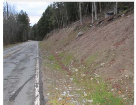
View looking West At slope to be stabilized