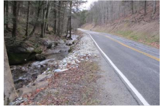
View looking West At area of stream to be stabilized

Detour of Traffic: Traffic will be detoured utilizing VT Route 103 and US Route 7.