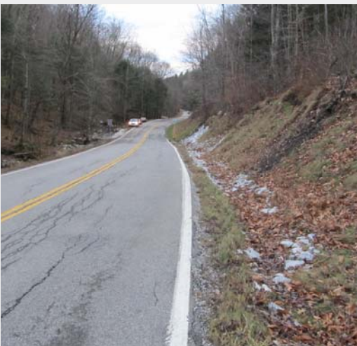
Existing view Looking West

Due to site constraints, there is limited space complete the necessary construction with all equipment that is required; therefore VT Route 140 will be closed for approximately 28 days. Traffic will be detoured during the closure.