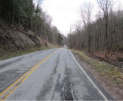
Existing view Looking East