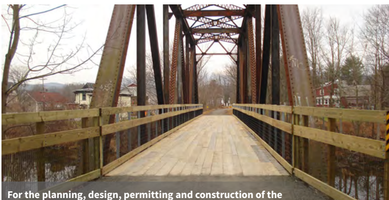
For the planning, design, permitting and construction of the Lamoille Valley Rail Trail, VHB utilized nearly all of the skills listed above.

We've put together a team in this proposal that reflects VHB's continued commitment to improve mobility, enhance Vermont communities, and balance development and infrastructure needs with environmental stewardship. While every project does not require this deep pool of talent, the resources are there when needed and our Vermont team can continue to call upon these key people as they have in the past.