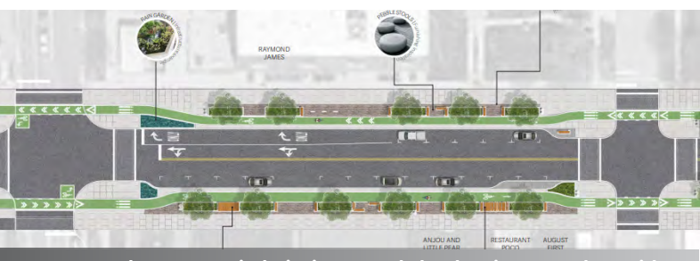
The VHB team is designing expanded pedestrian areas along with separated bike lanes along Main Street in Burlington

VHB has a proud history of working with state, regional, and municipal clients across Vermont to help them envision, plan, design, and construct a wide range of bicycle and pedestrian facilities. VHB's bicycle and pedestrian professionals deliver innovative, creative, and cost-effective solutions that integrate safe and efficient multimodal facilities into the built environment. We work closely with our clients and project stakeholders to determine the best use of limited funds to design environmentally sensitive and sustainable projects. We also understand the importance of broad community outreach and involving stakeholders early on in the process to establish community consensus around the project elements.