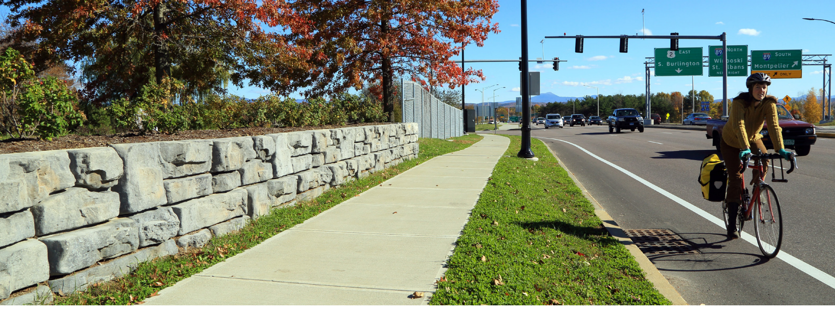
Widening Route 2 at I-89 Exit 14, South Burlington, Vermont

avoiding the need to remove critical parking spaces for the shopping center along the corridor