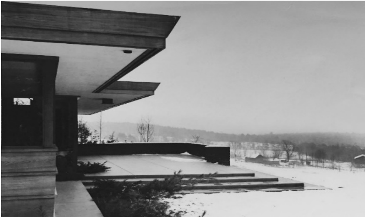
Figure 5 Historic view of patio and viewshed (Art Institute of Chicago)

integrity by remaining true to the ideas of their architect – refusing to descend into the basement of conniving with the builder to change things behind their architect's back - a somewhat common event. Few things mean so much to an architect, especially a young one. 60