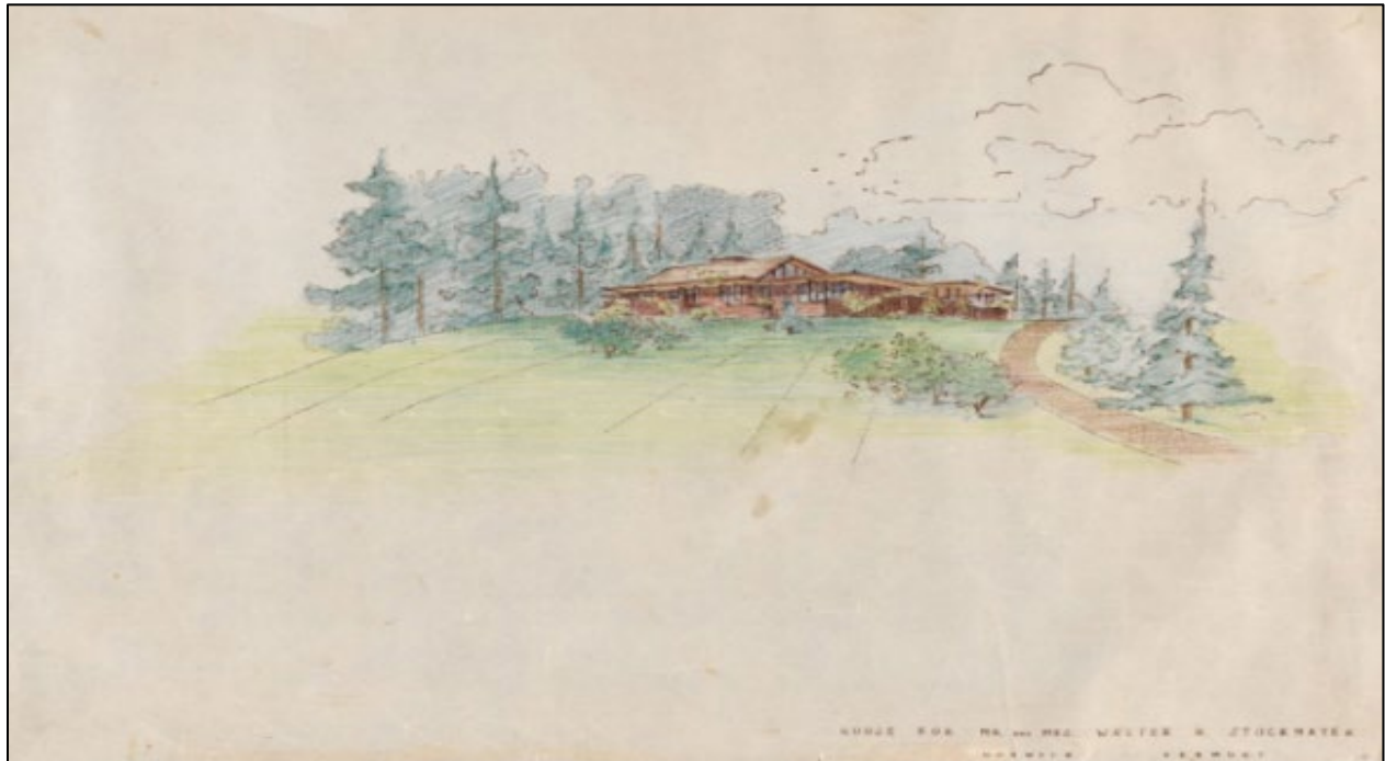
Figure 2 Original Presentation Drawings (Art Institute of Chicago)

Sylvia Stockmayer wrote back to Gelbin in late January, expressing her comfort with the architect: