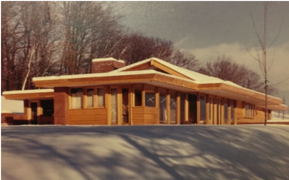
Figure 4 Construction Photograph (Art Institute of Chicago)

If one would make the ceilings feel higher, use that one. If saffron looks yellow at night, I tend toward the dark buff, but it is certainly a small difference to us. 50