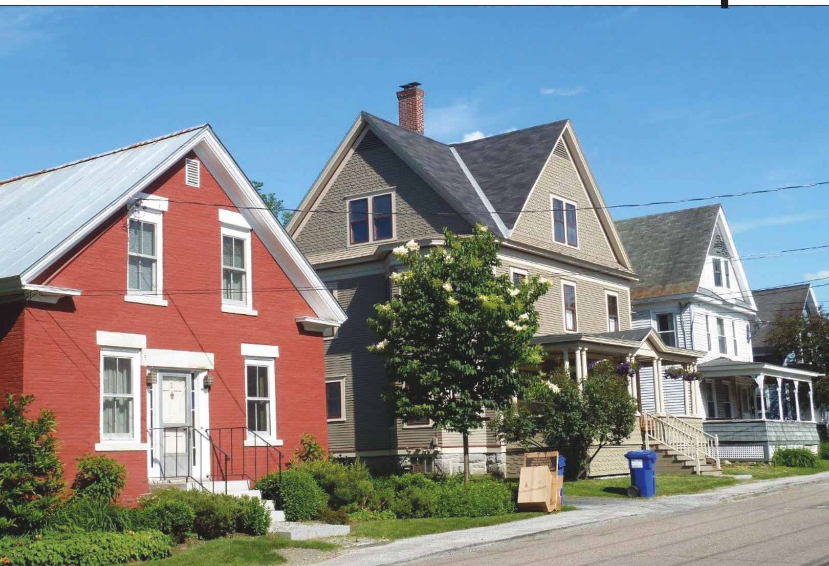
Agency of Commerce and Community Development Department of Housing and Community Development January 15, 2018