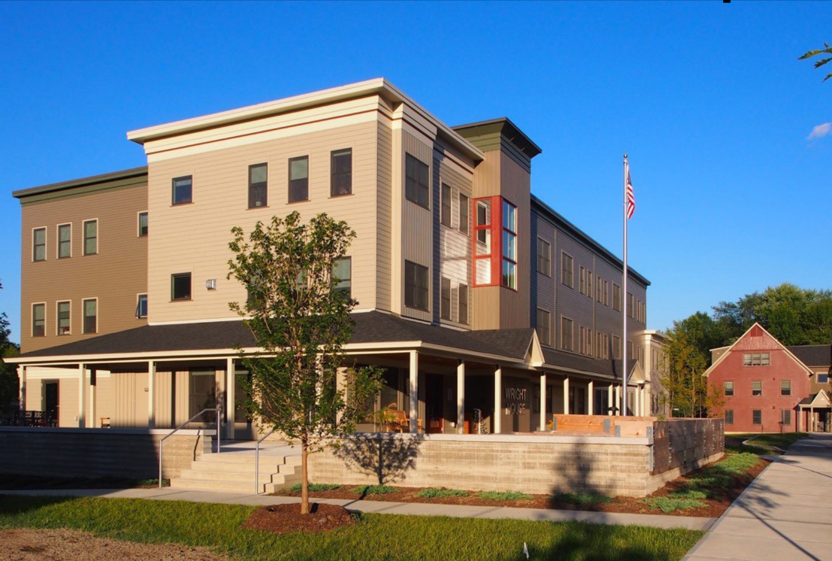
Agency of Commerce and Community Development Department of Housing and Community Development January 15, 2017