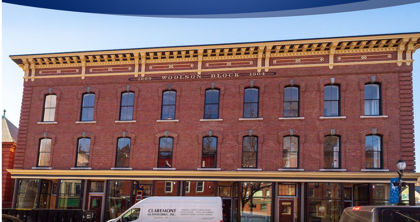
Springfield Vermont, Woolson Block