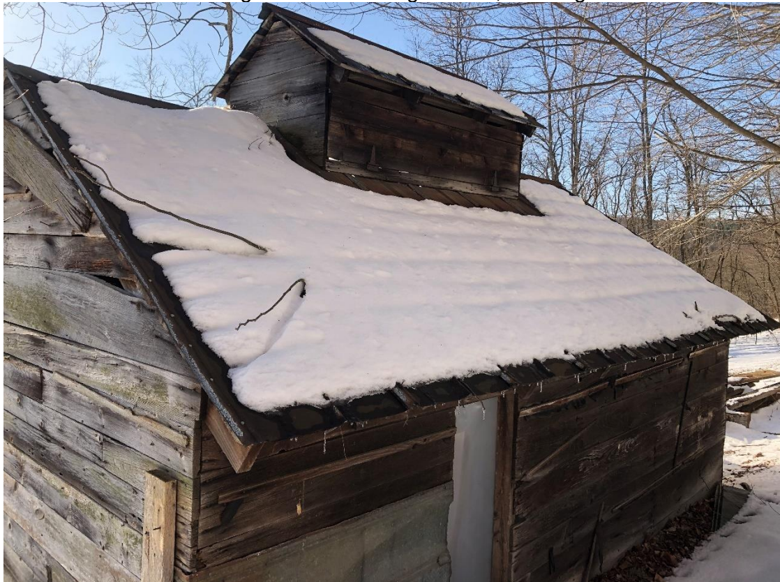
Detail of sugarhouse and roof monitor