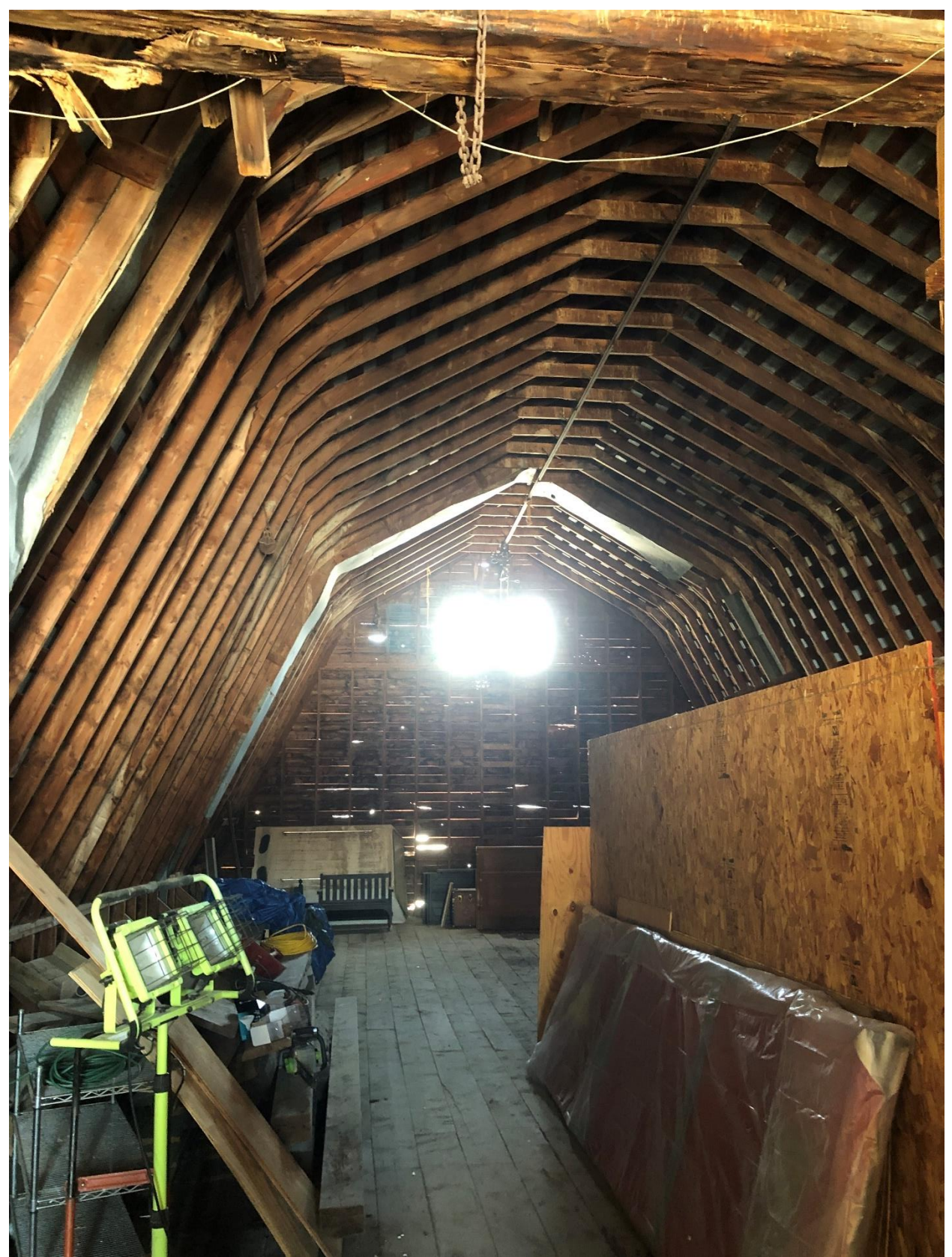
Hayloft in gambrel roof barn addition