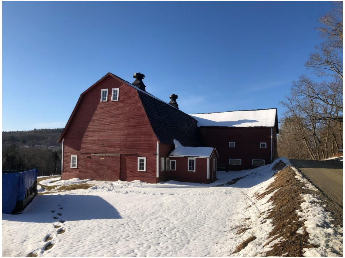
View looking south at barn complex