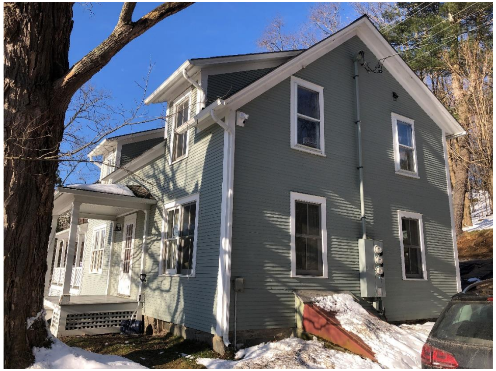
View looking southwest at house. Note asymmetrical roofline.