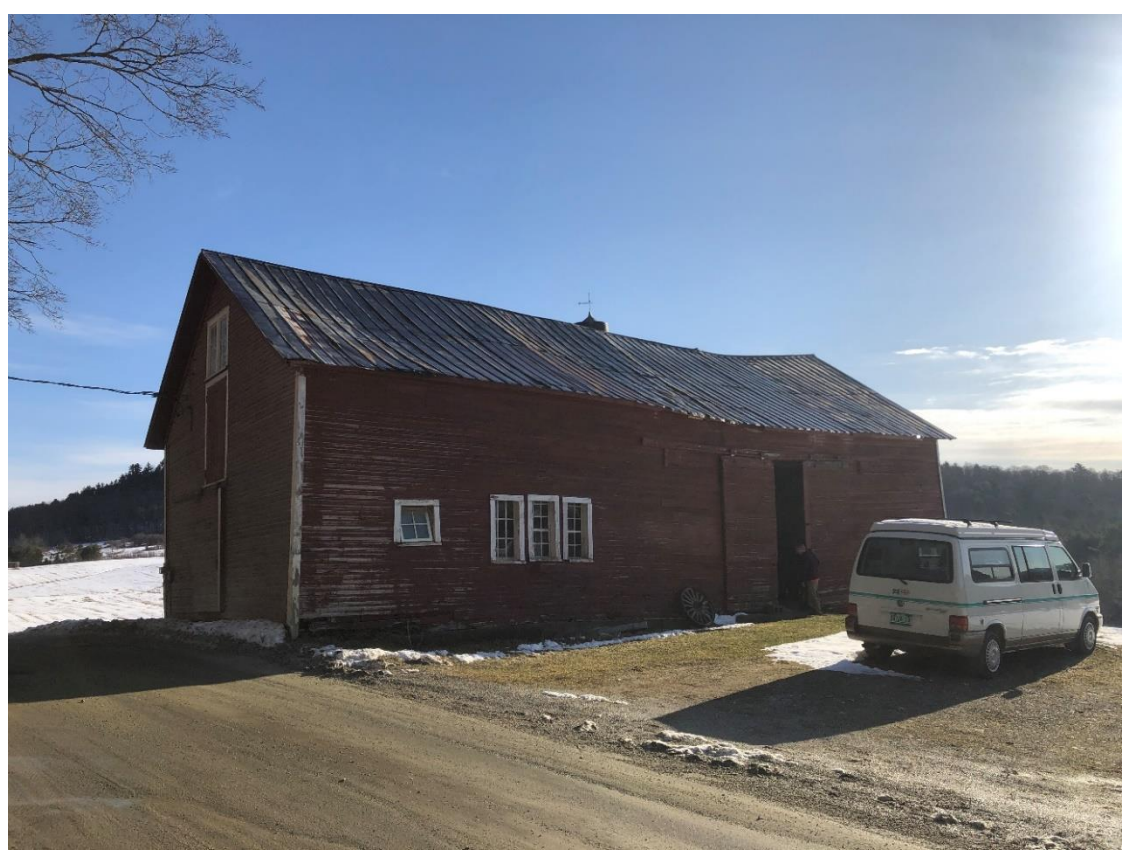
View looking north at barn complex