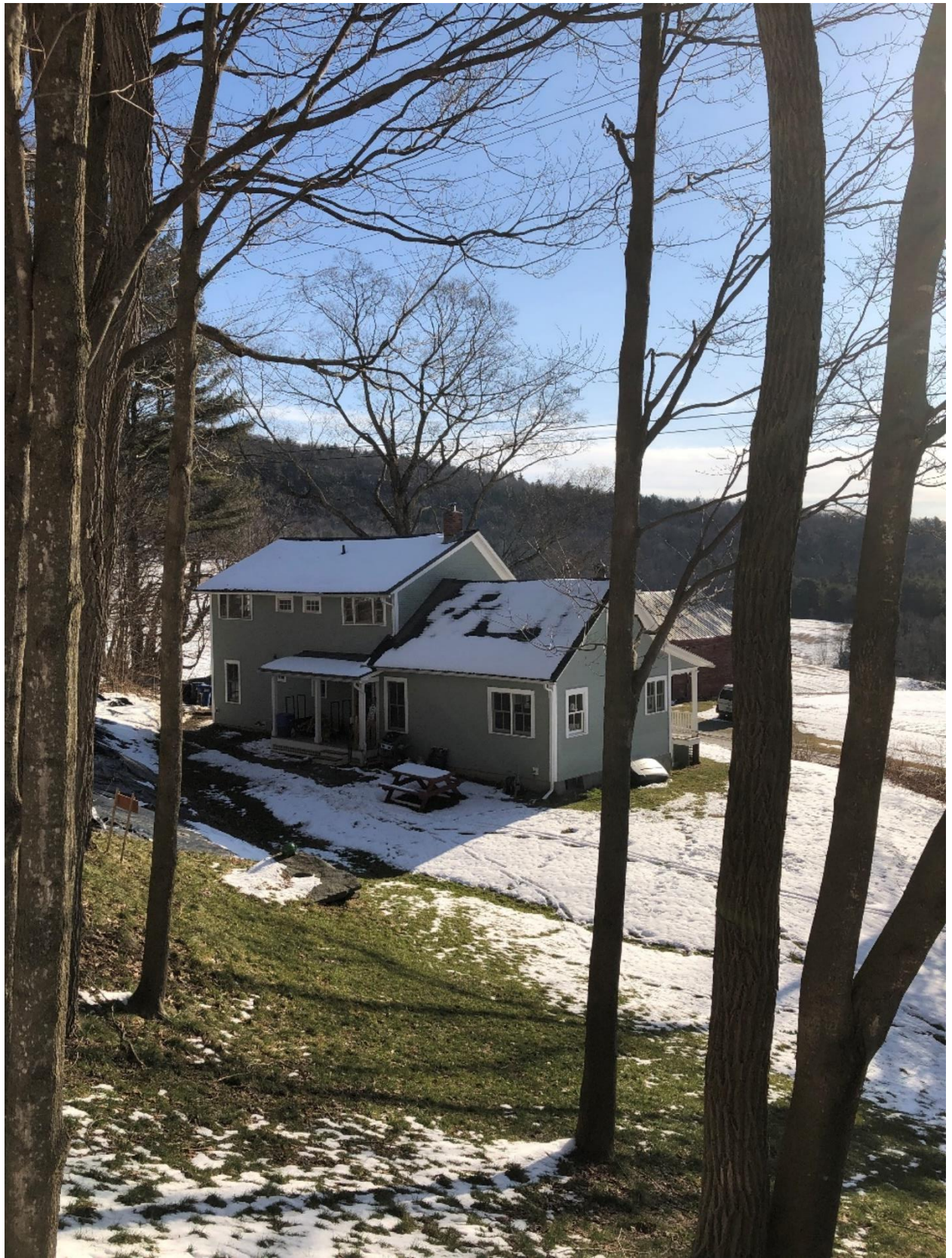
View looking northeast at house.