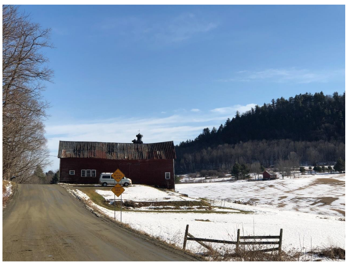
View looking north at barn complex with agricultural field on right