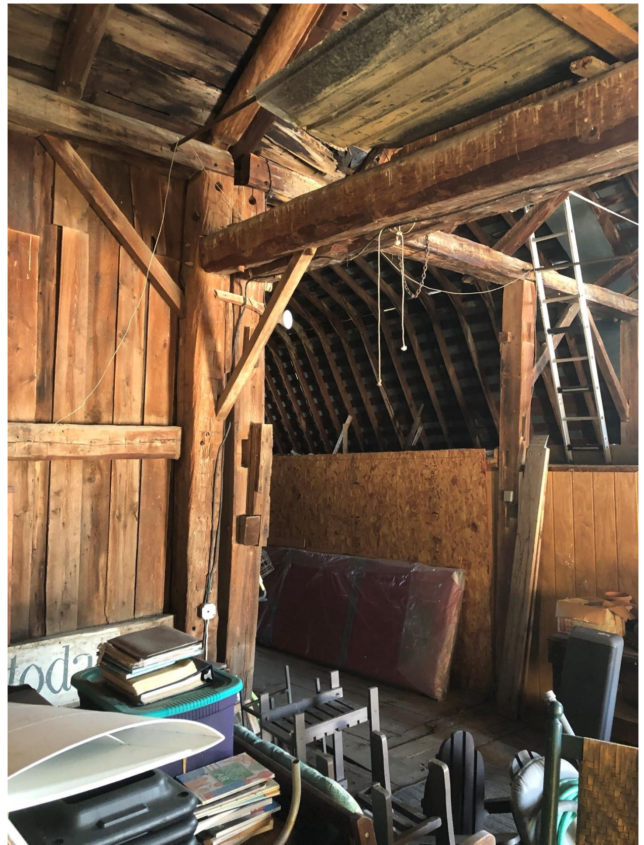
Barn framing an junction of east and west barns (note double corner posts) with gambrel roof barn in the background.