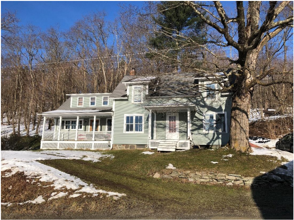
View looking west at façade of house