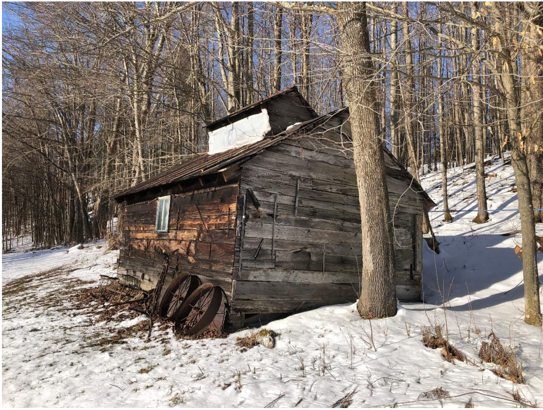
View looking southwest at sugarhouse, with sugarbush