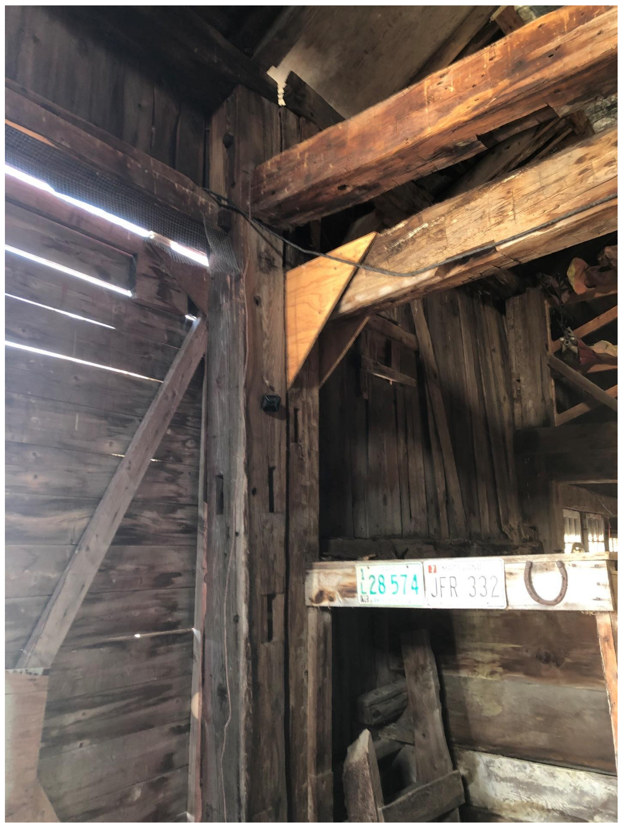
Detail of timber frames in east and west barns