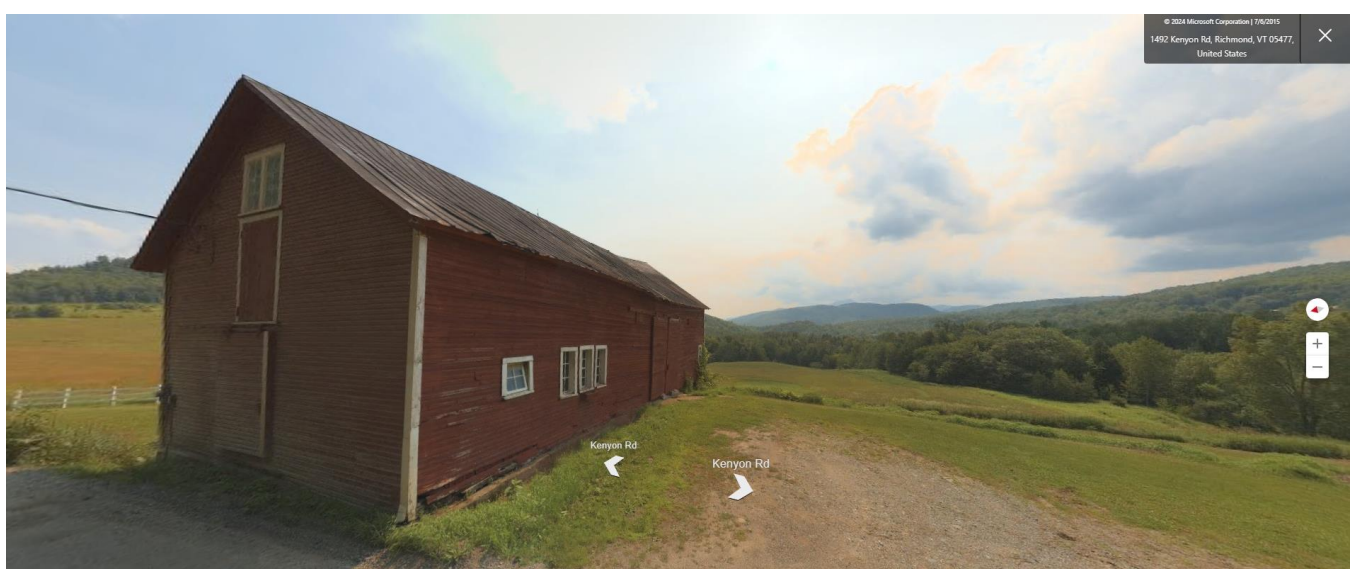
View looking east from Kenyon Road at barn complex and agricultural fields.

Advertisement for the sale of the Flagg Farm Burlington Free Press, October 7, 1913