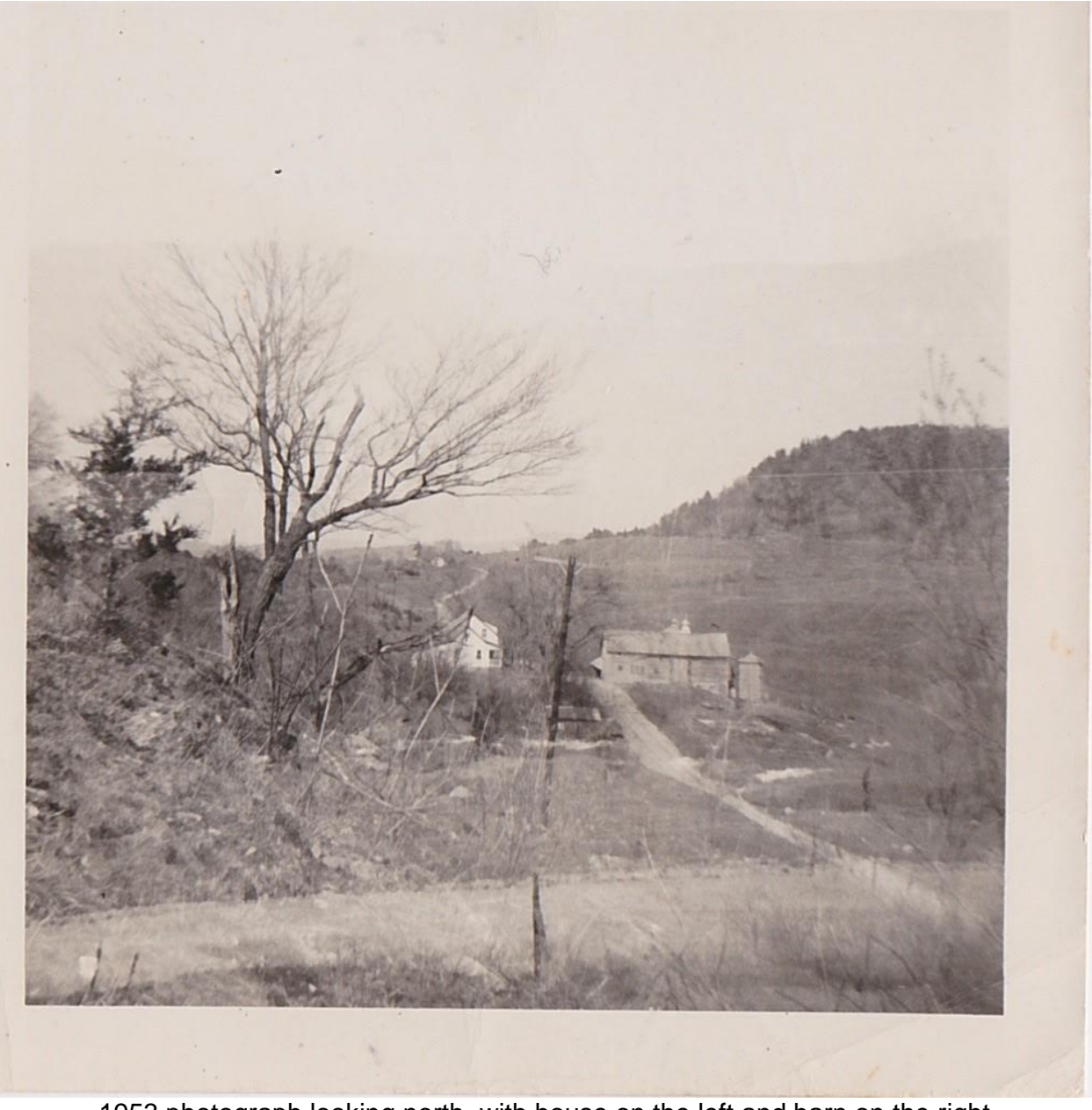
1953 photograph looking north, with house on the left and barn on the right