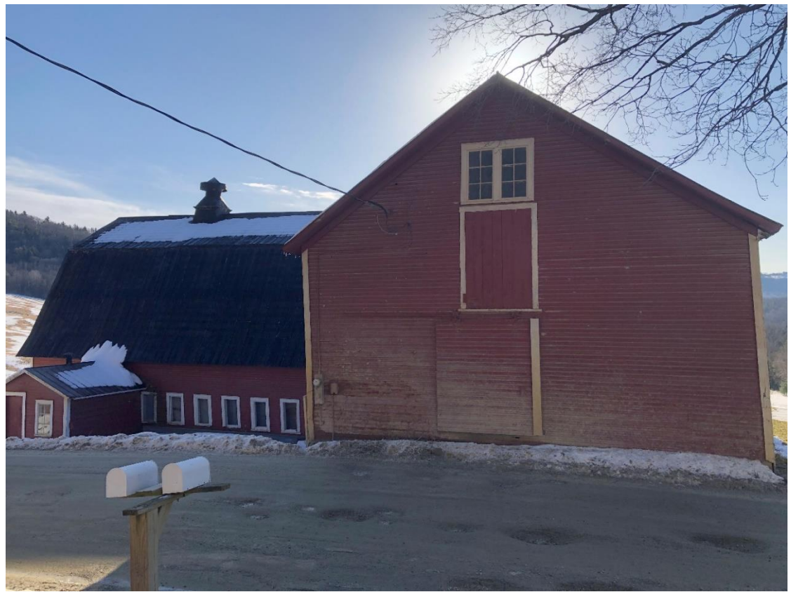
View looking east at barn complex