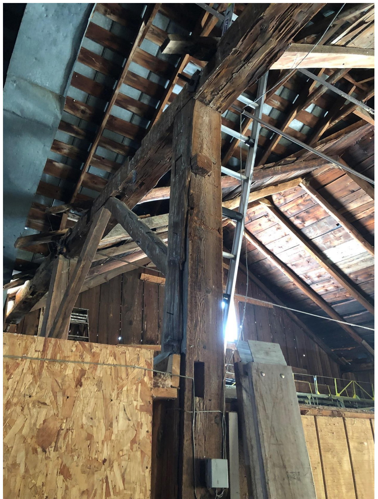
Detail of timber framing in east barn