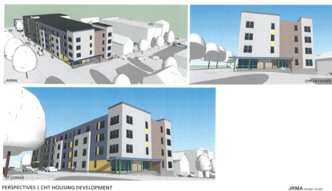
Maiden Lane - St. Albans