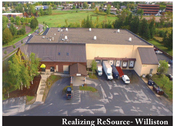
Realizing ReSource- Williston