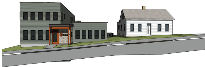
54-60 SOUTH MAIN BRATTLEBORO, VERMONT

Duncan WISNIEWSKI A NEW FUTURE ARCHITECTURE P2