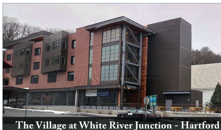
The Village at White River Junction - Hartford