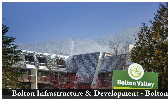
Bolton Infrastructure & Development - Bolton