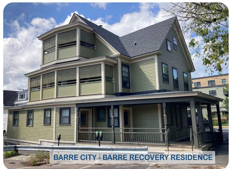
BARRE CITY - BARRE RECOVERY RESIDENCE