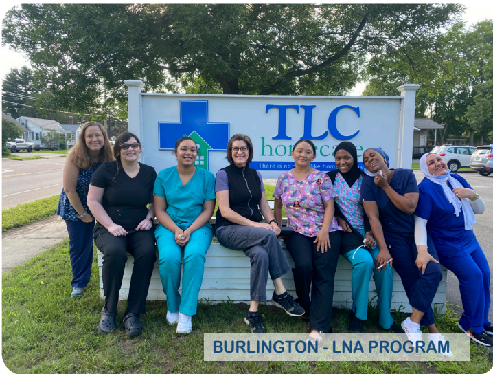
BURLINGTON - LNA PROGRAM

81,323 persons served by public facilities/services