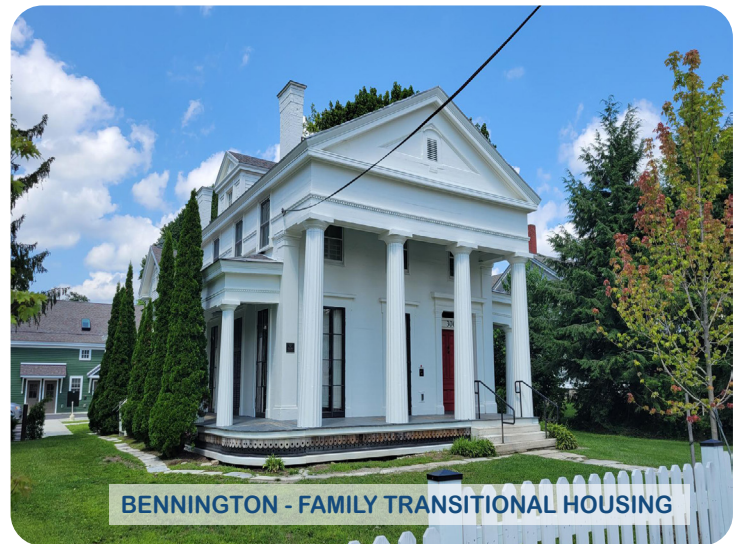
BENNINGTON - FAMILY TRANSITIONAL HOUSING