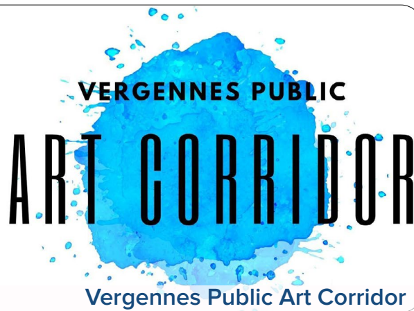
Vergennes Public Art Corridor