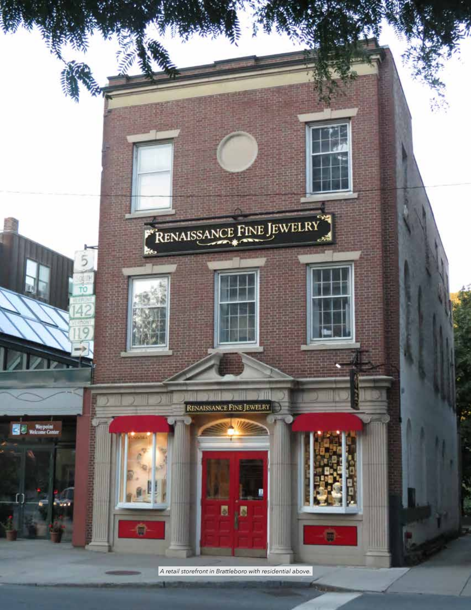
A retail storefront in Brattleboro with residential above.