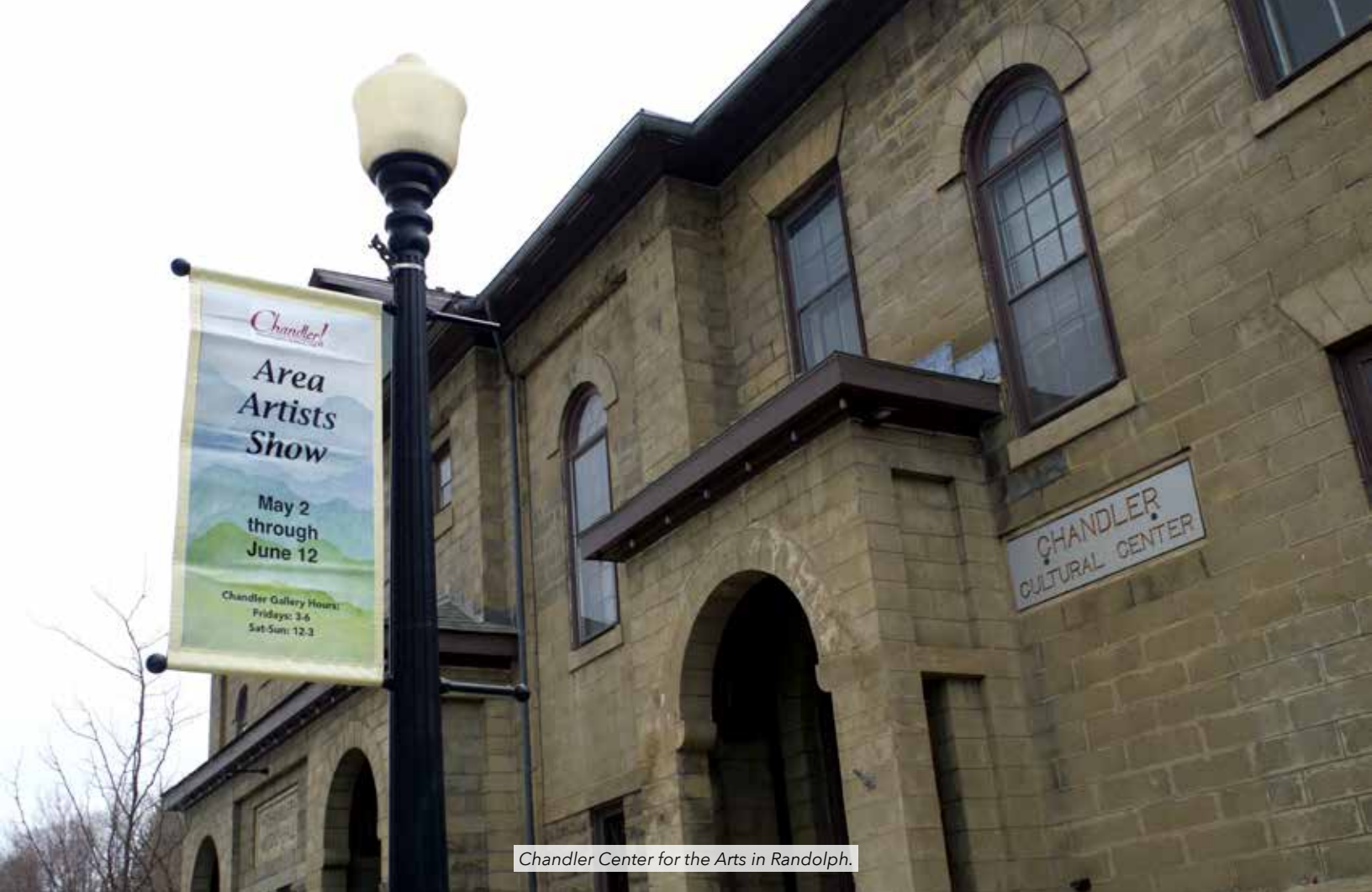
Chandler Center for the Arts in Randolph.