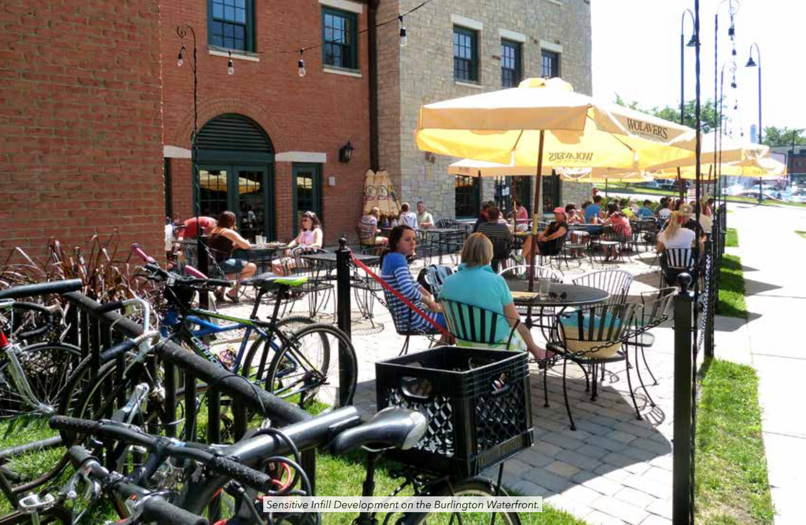
Sensitive Infill Development on the Burlington Waterfront.