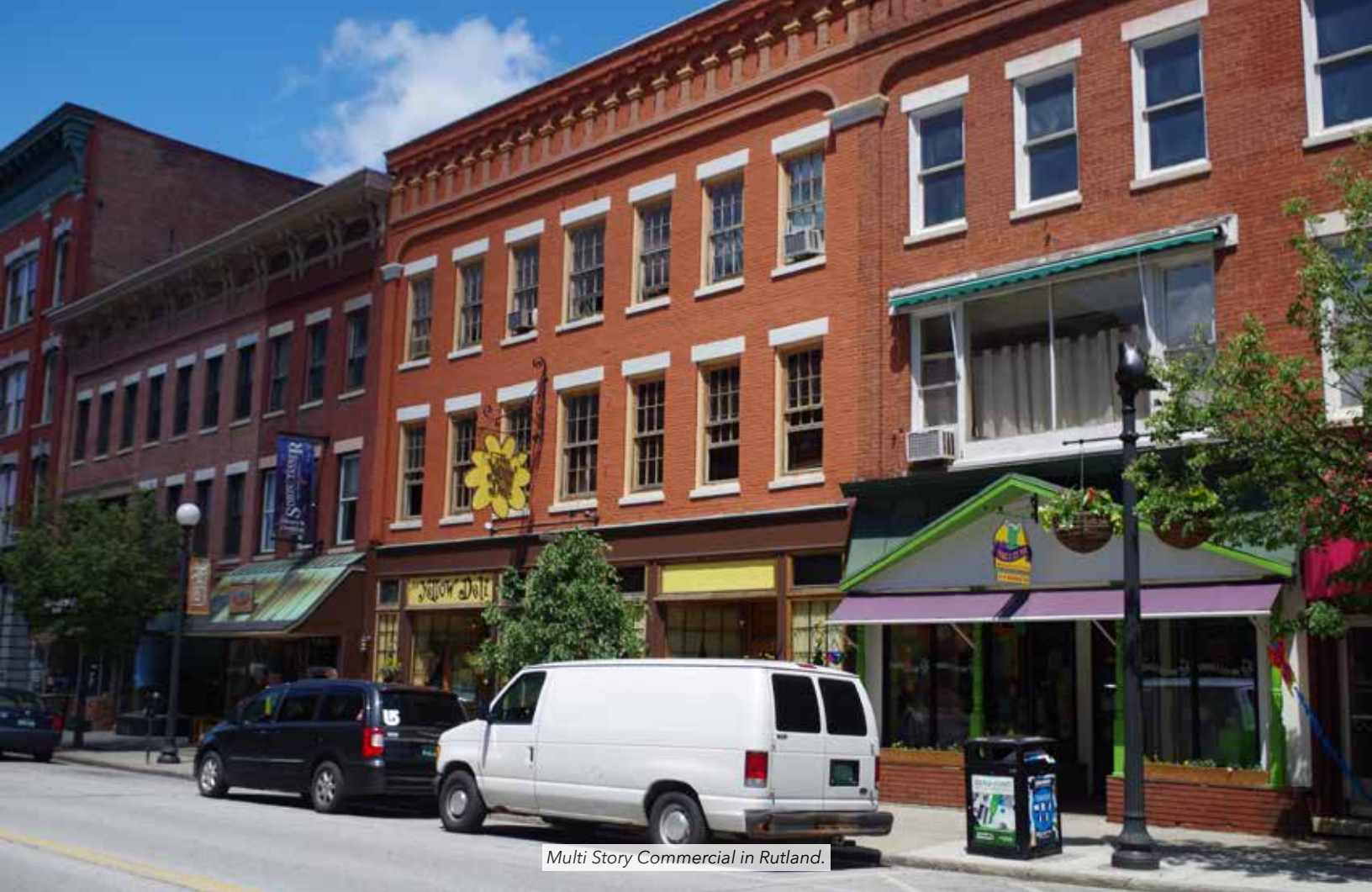
Multi Story Commercial in Rutland.