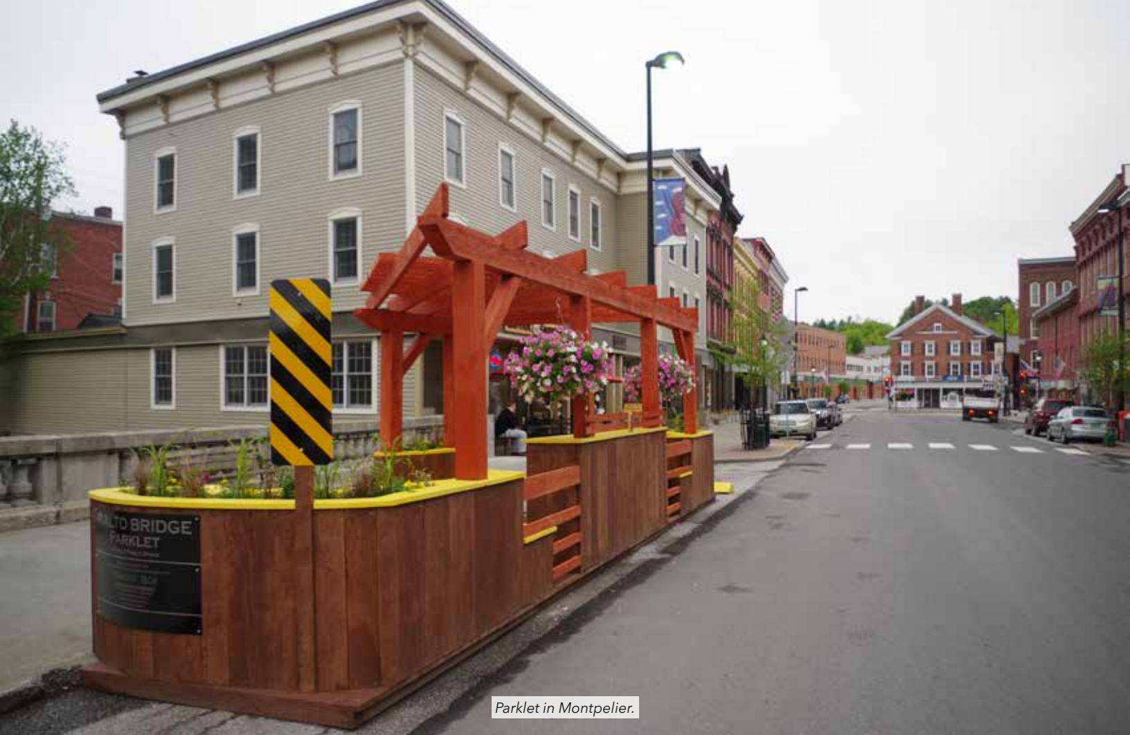
Parklet in Montpelier.