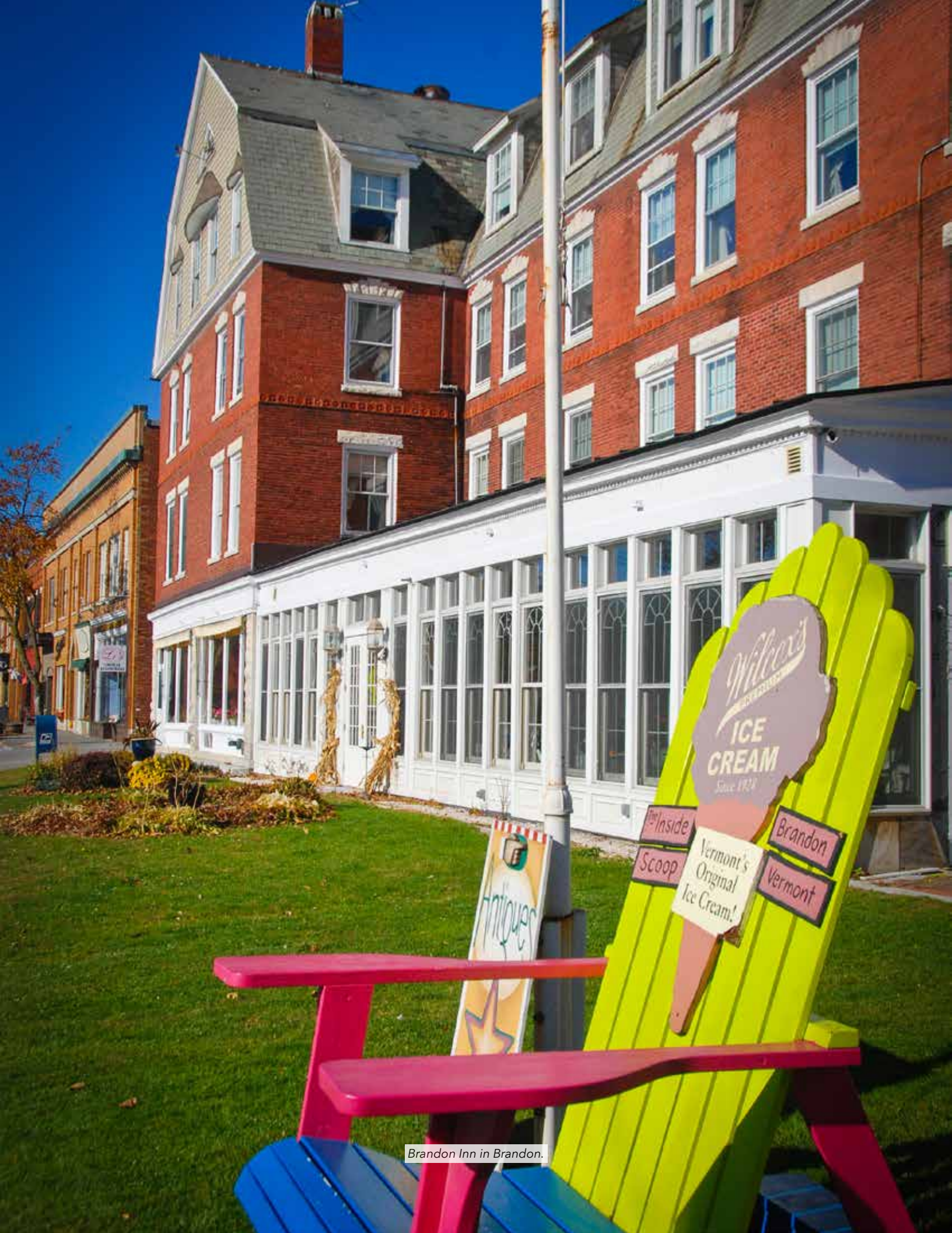
Brandon Inn in Brandon.