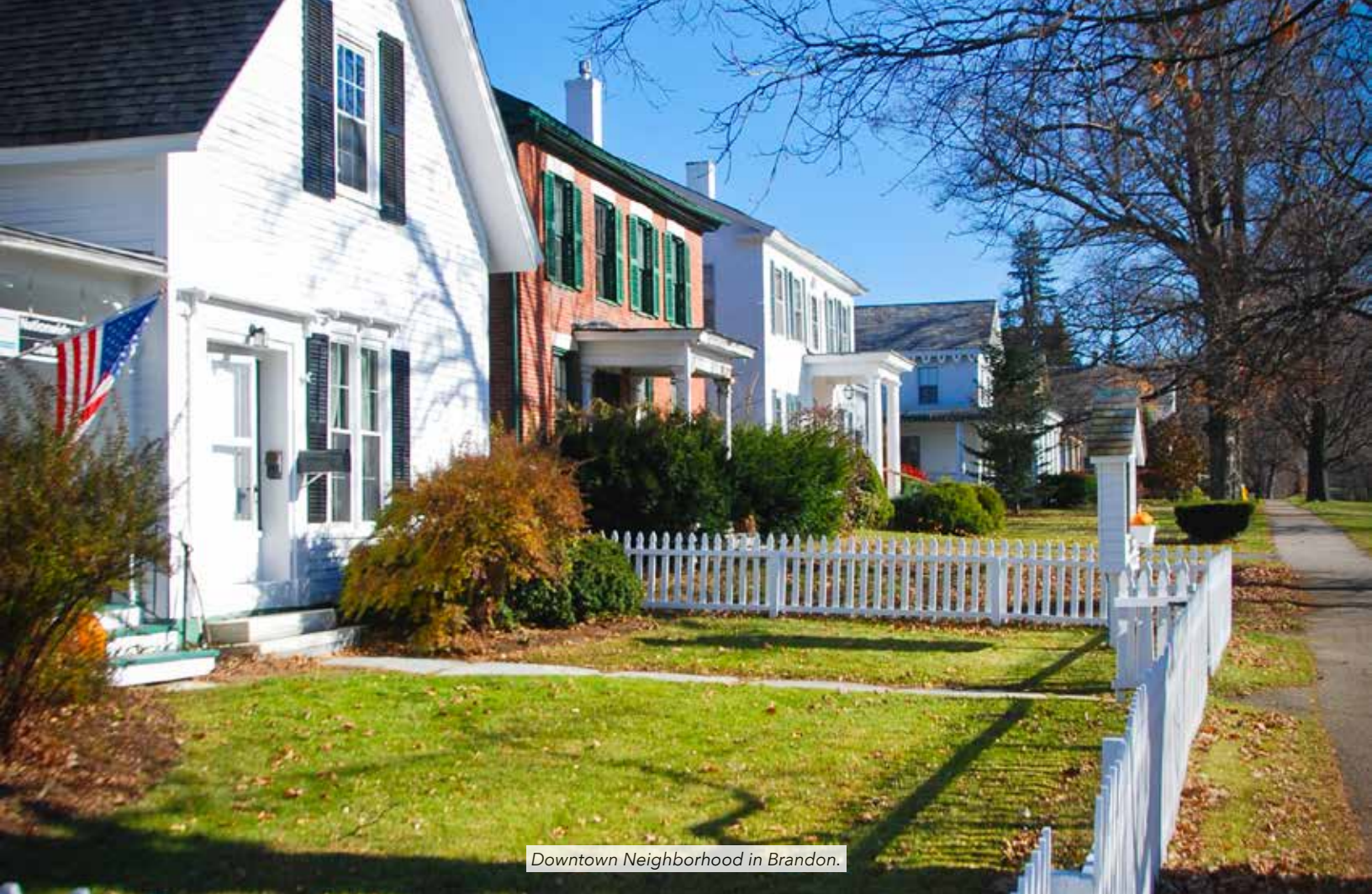
Downtown Neighborhood in Brandon.