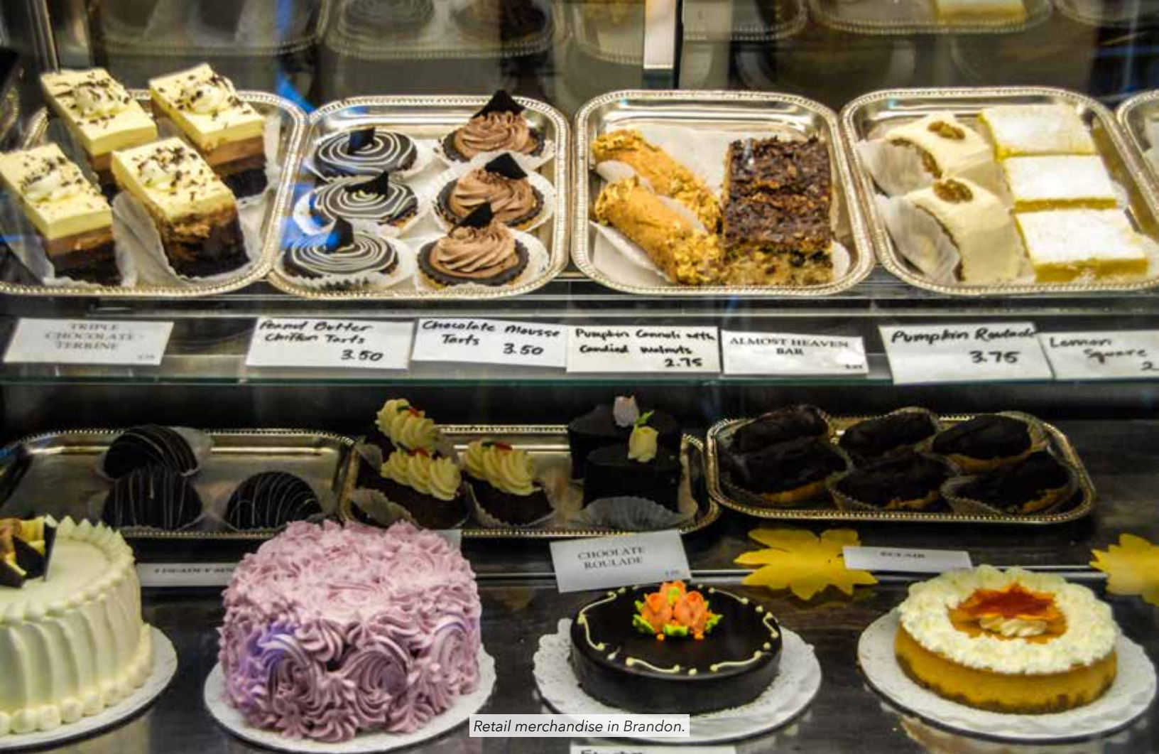
Retail merchandise in Brandon.