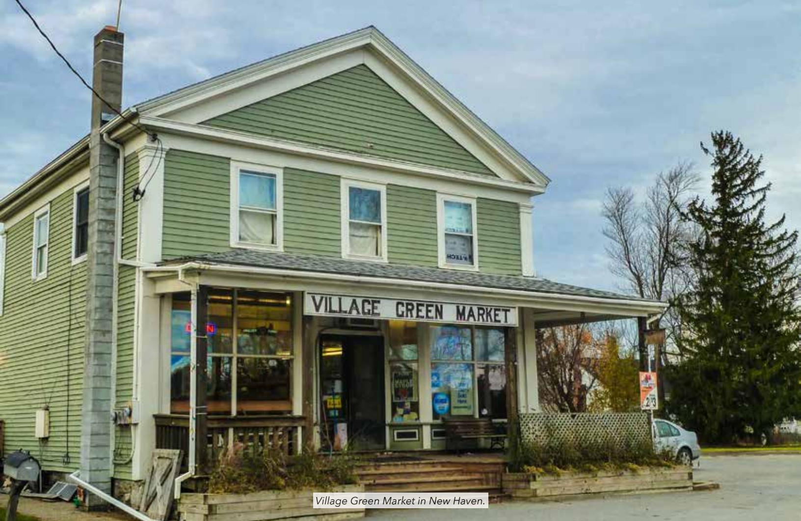
Village Green Market in New Haven.