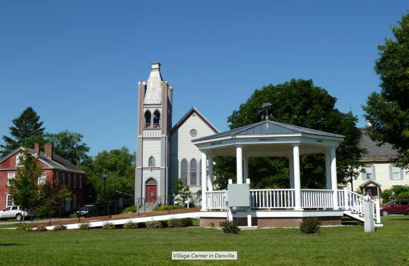
Village Center in Danville.