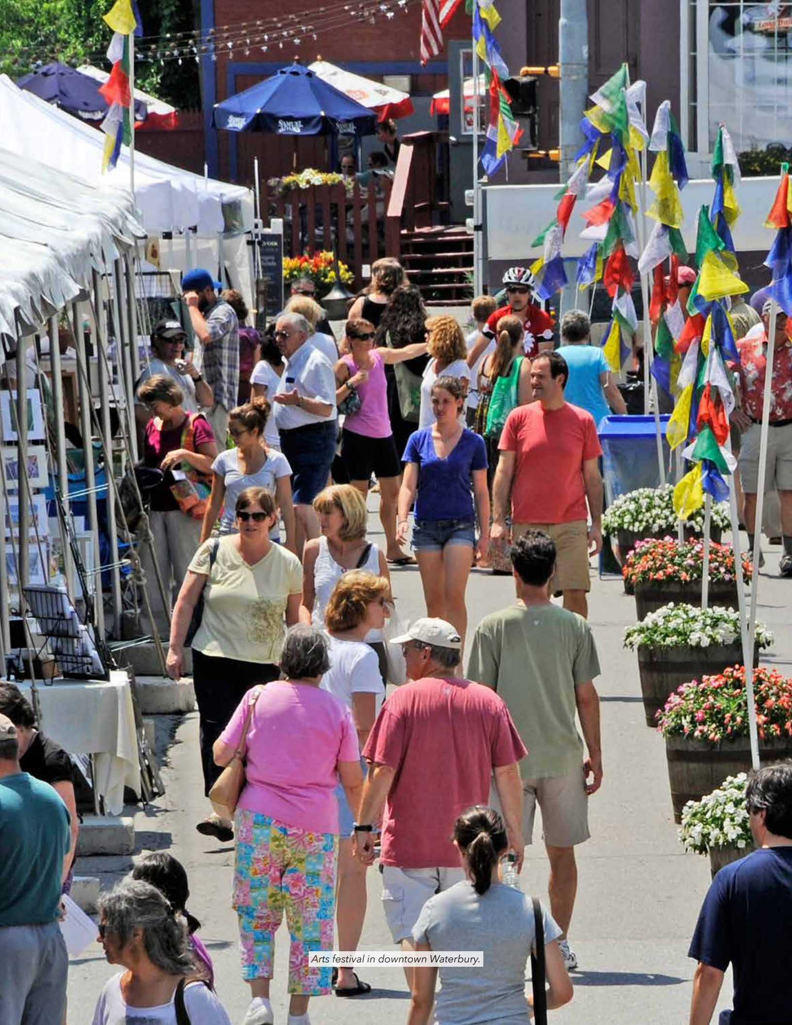
Arts festival in downtown Waterbury.