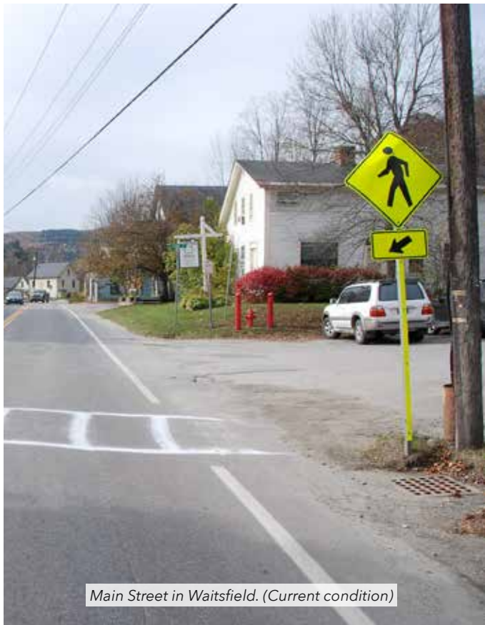
Main Street in Waitsfield. (Current condition)