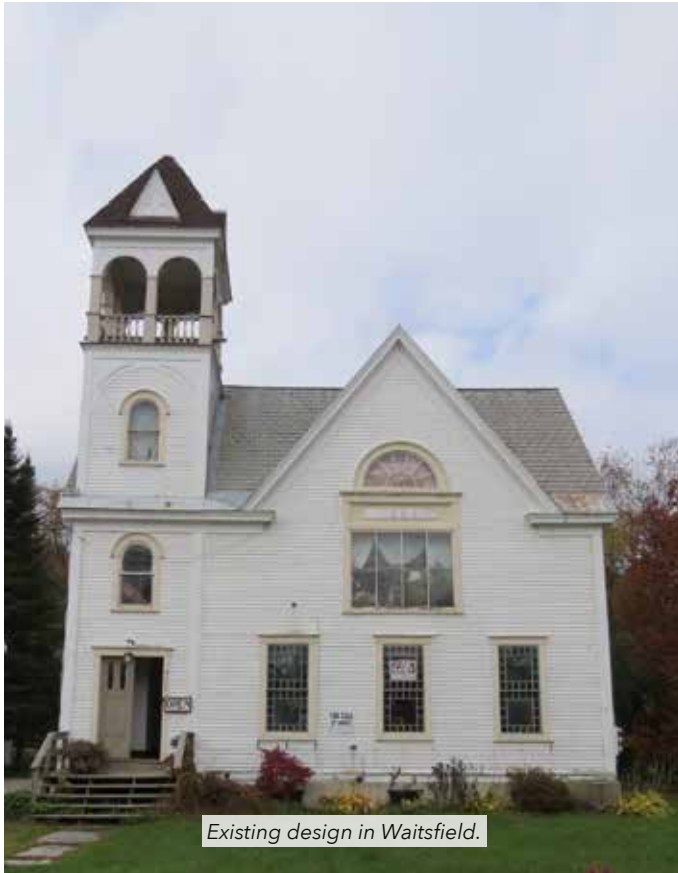
Existing design in Waitsfield.