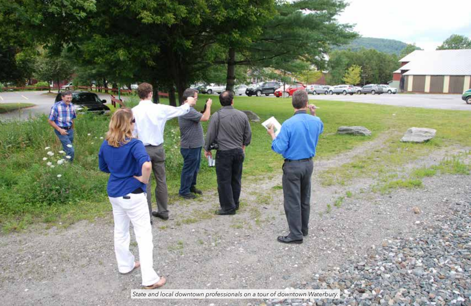
State and local downtown professionals on a tour of downtown Waterbury.