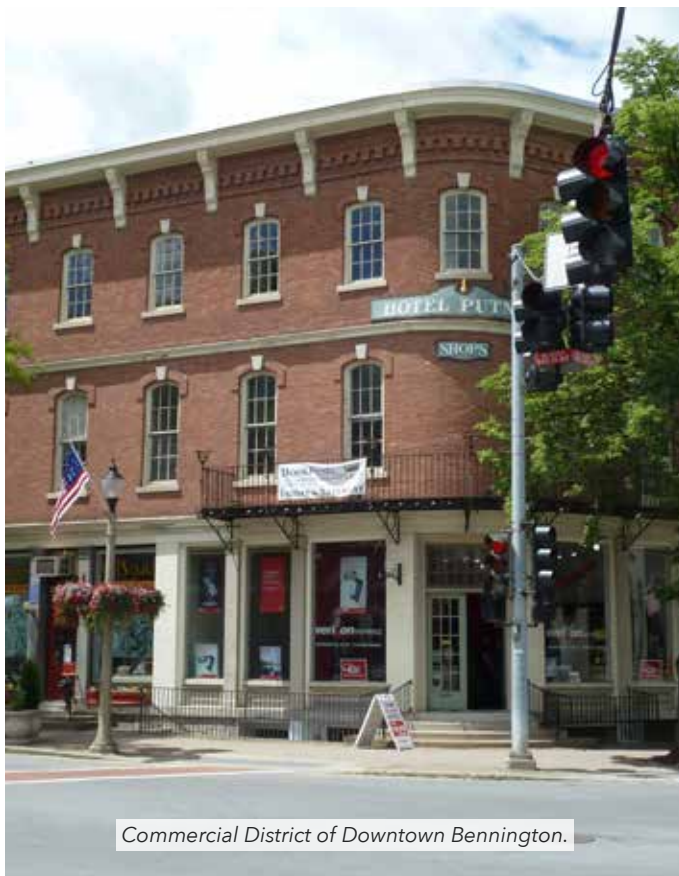
Commercial District of Downtown Bennington.