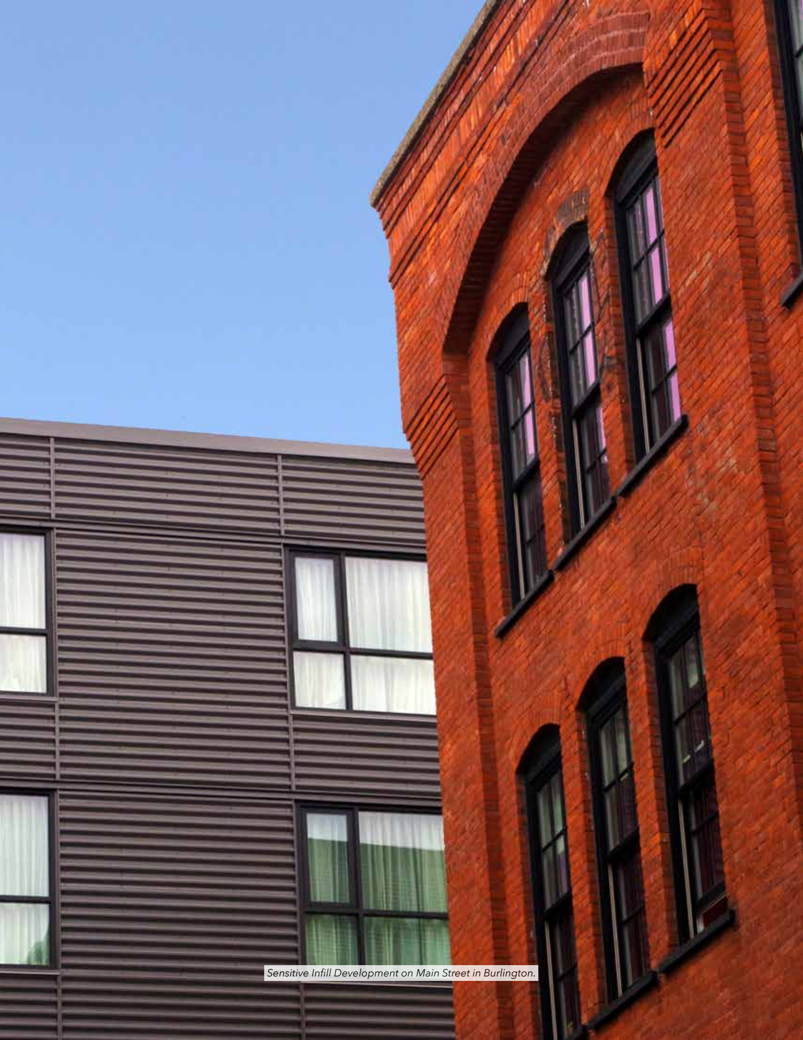
Sensitive Infill Development on Main Street in Burlington.