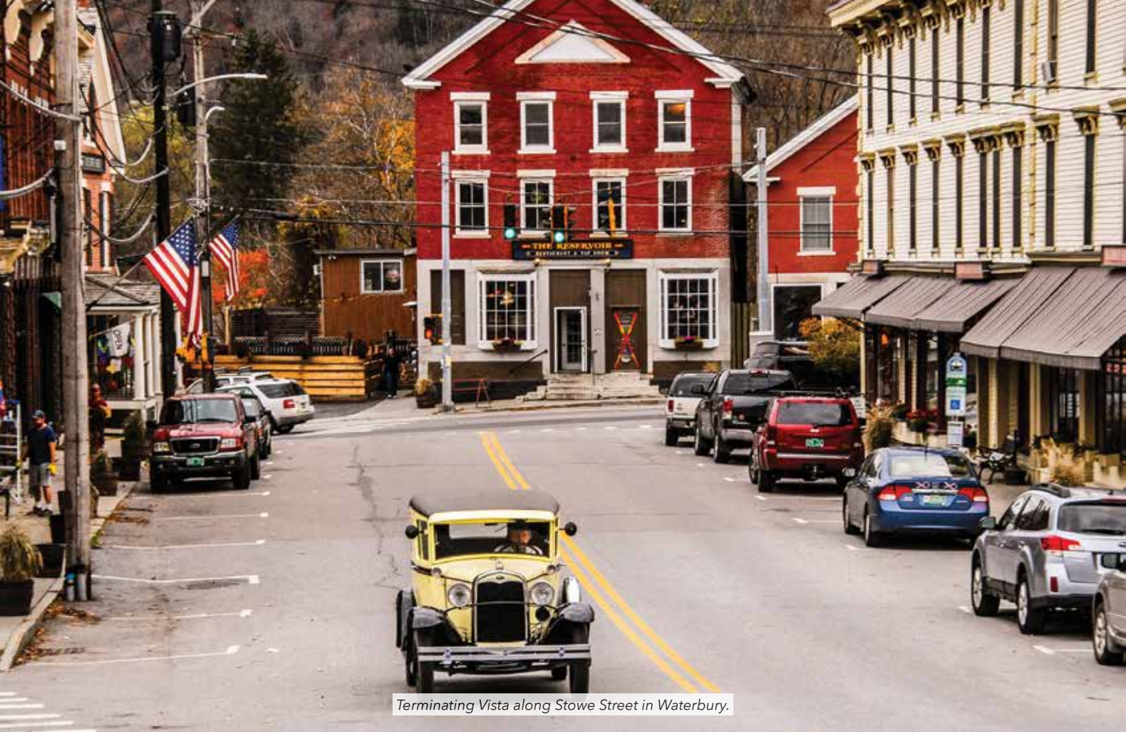
Terminating Vista along Stowe Street in Waterbury.