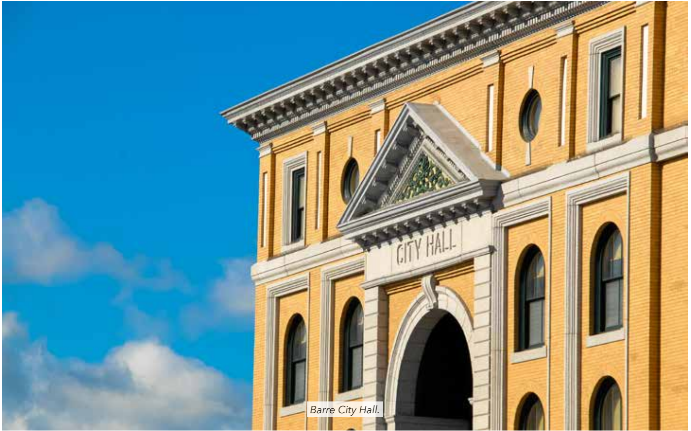
Barre City Hall.