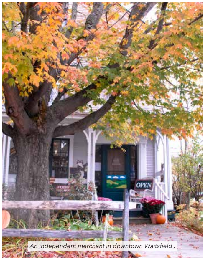
An independent merchant in downtown Waitsfield .