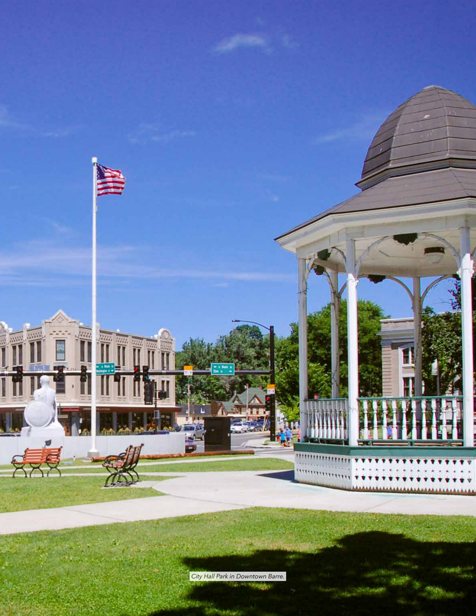
City Hall Park in Downtown Barre.