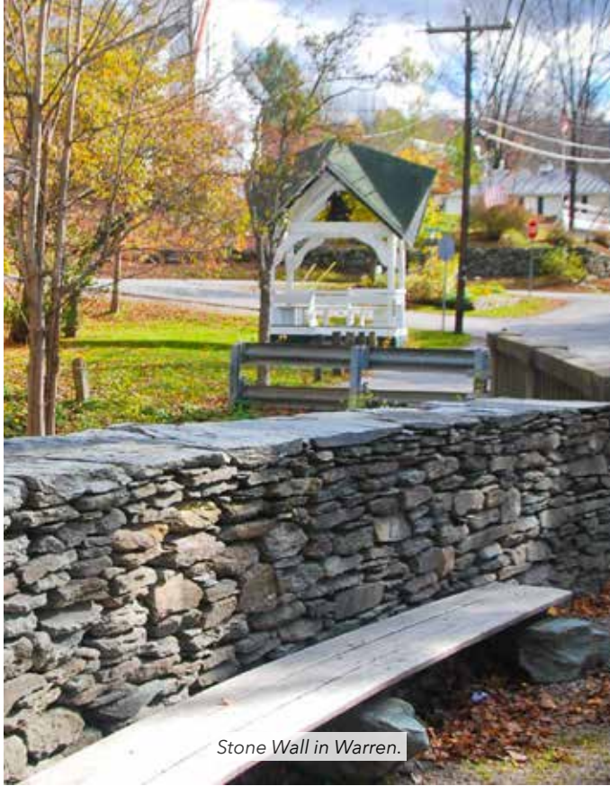
Stone Wall in Warren.