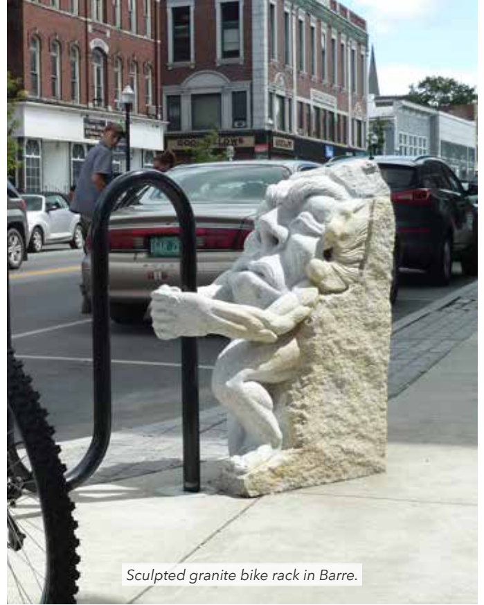
Sculpted granite bike rack in Barre.