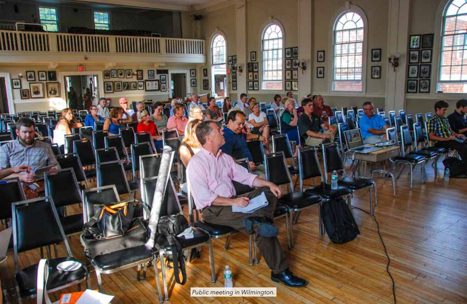
Public meeting in Wilmington.