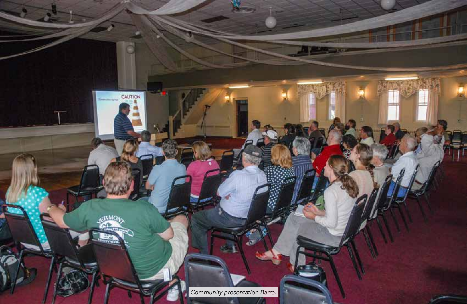
Community presentation Barre.