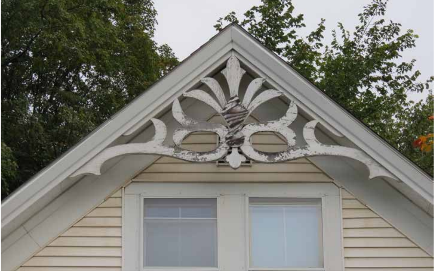
Examples of maintenance issues.