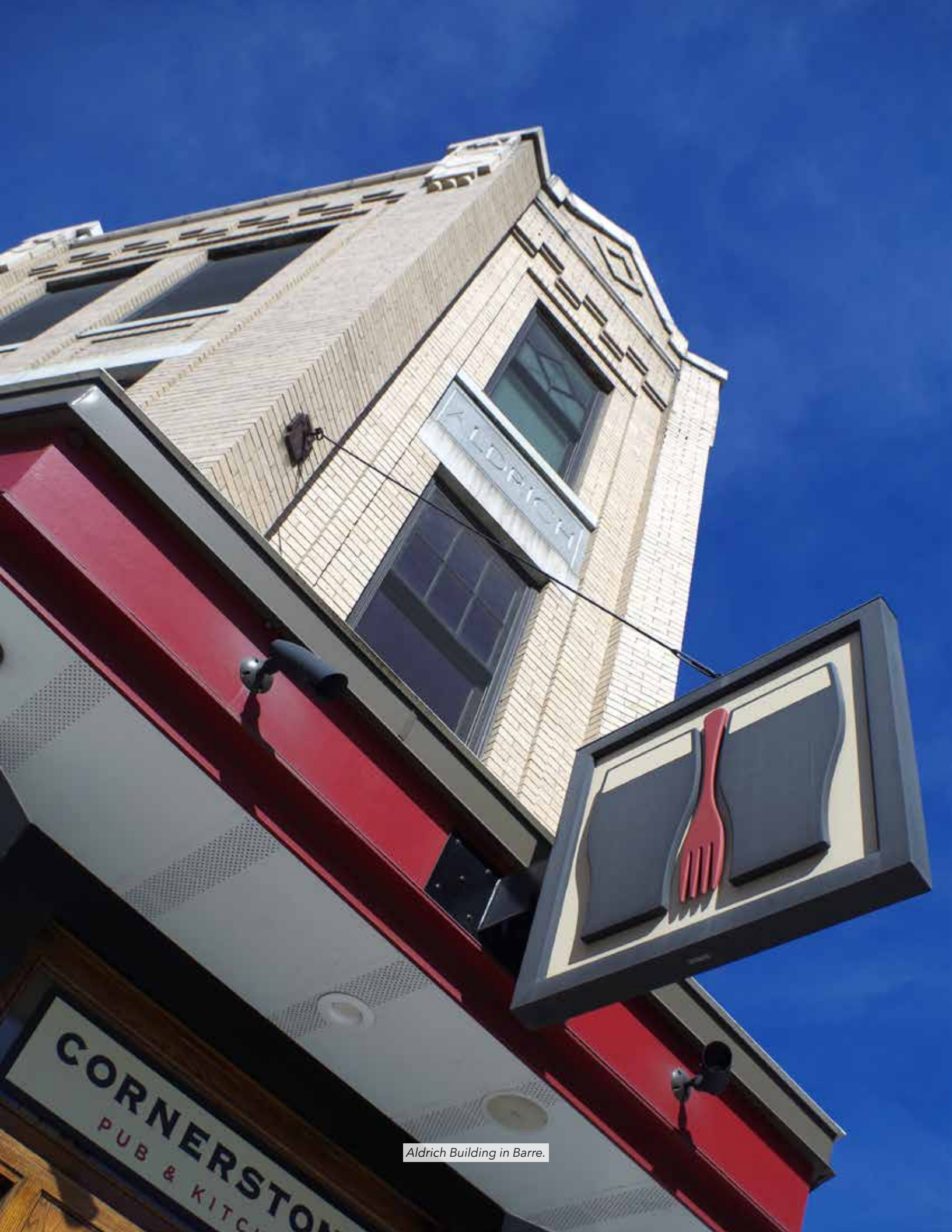
Aldrich Building in Barre.