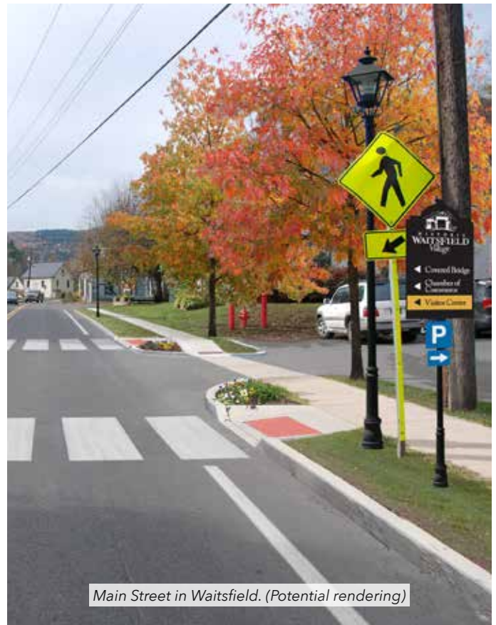
Main Street in Waitsfield. (Potential rendering)