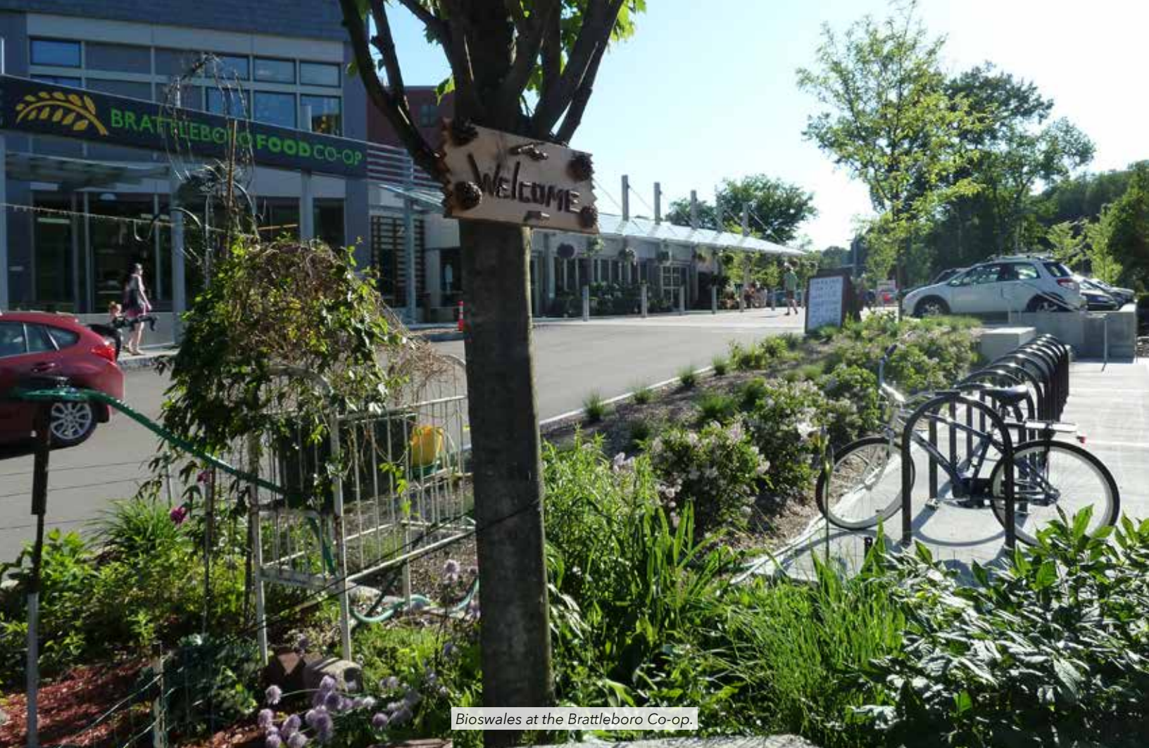
Bioswales at the Brattleboro Co-op.