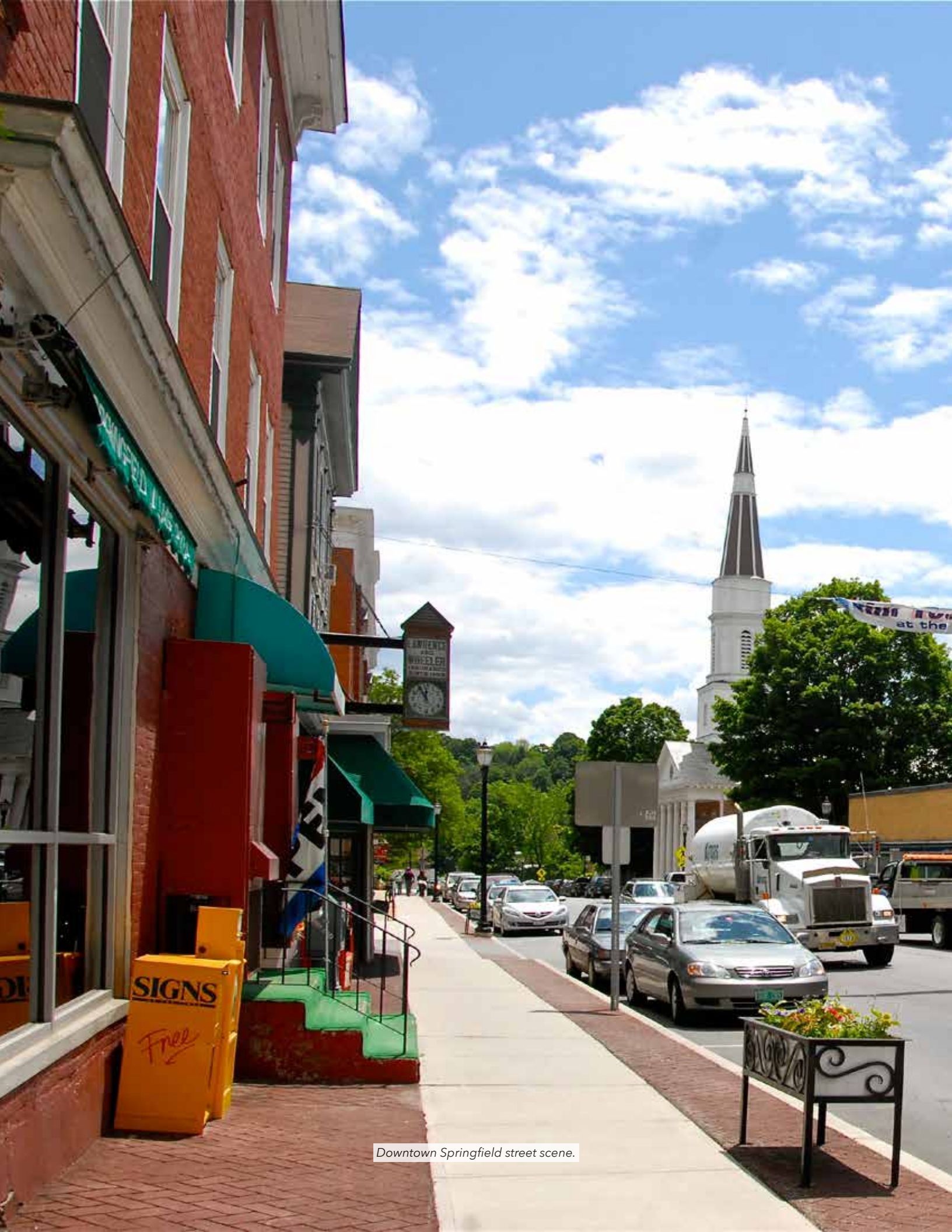
Downtown Springfield street scene.