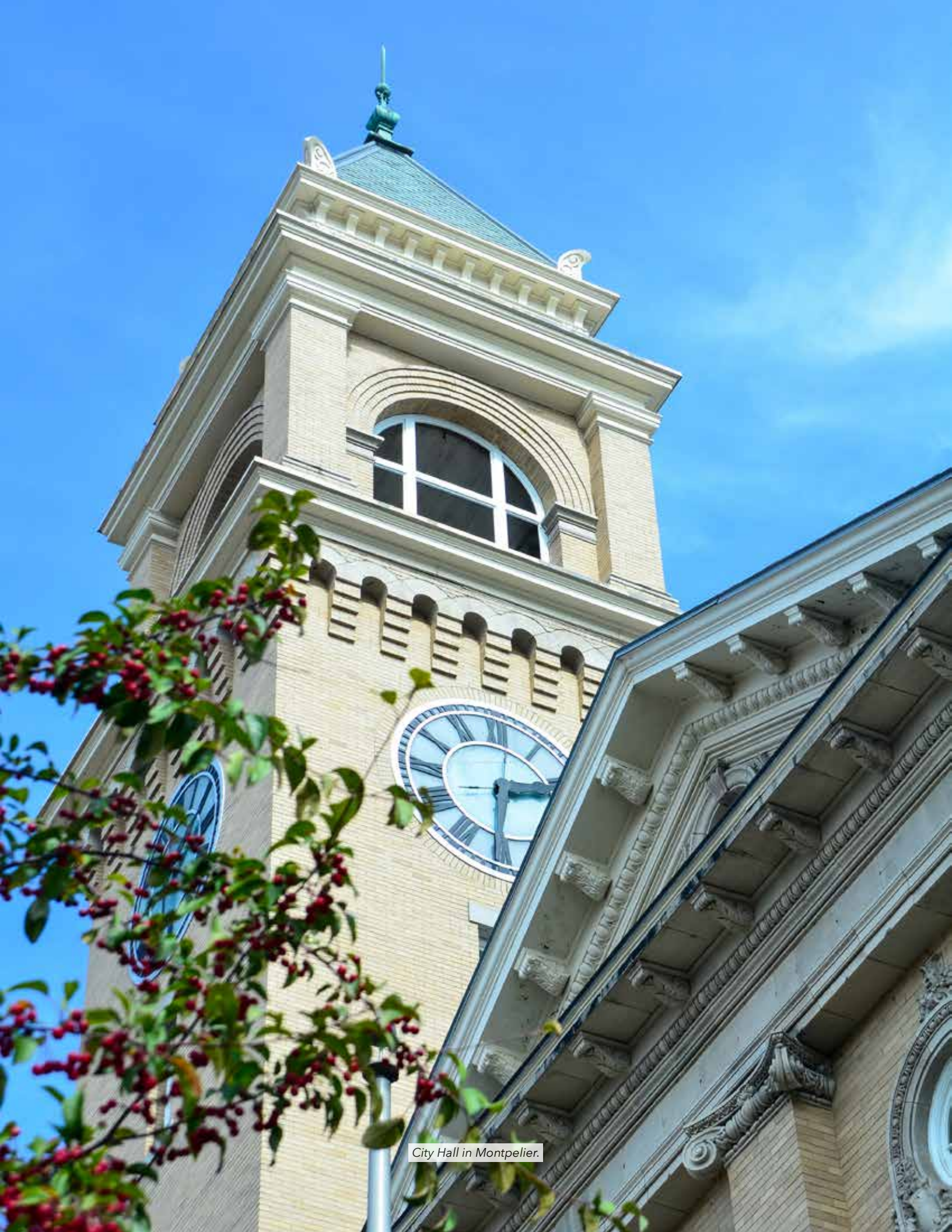
City Hall in Montpelier.