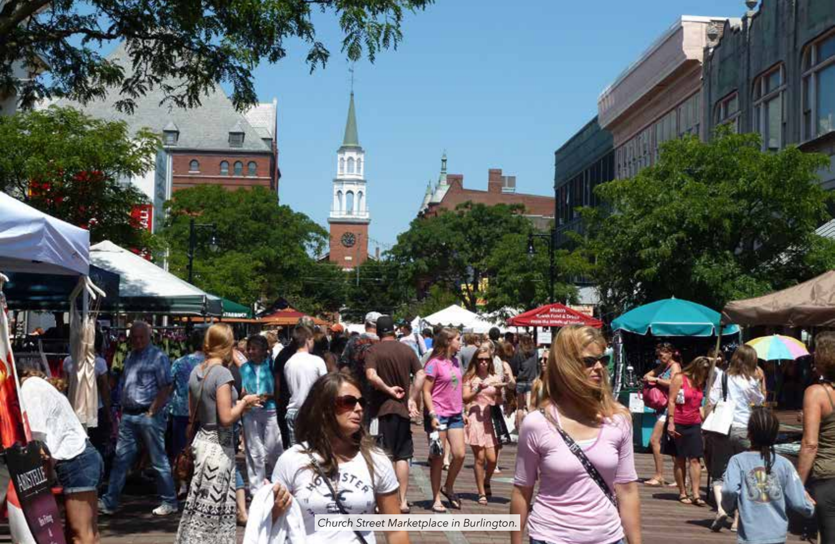
Church Street Marketplace in Burlington.