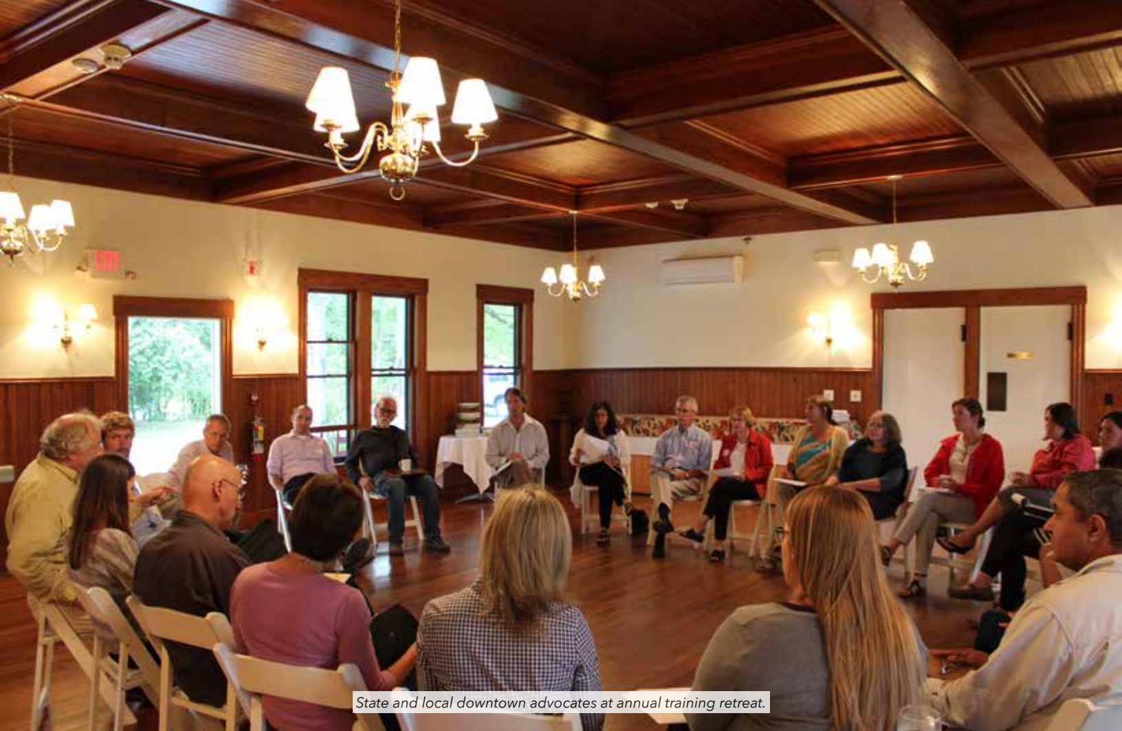
State and local downtown advocates at annual training retreat.