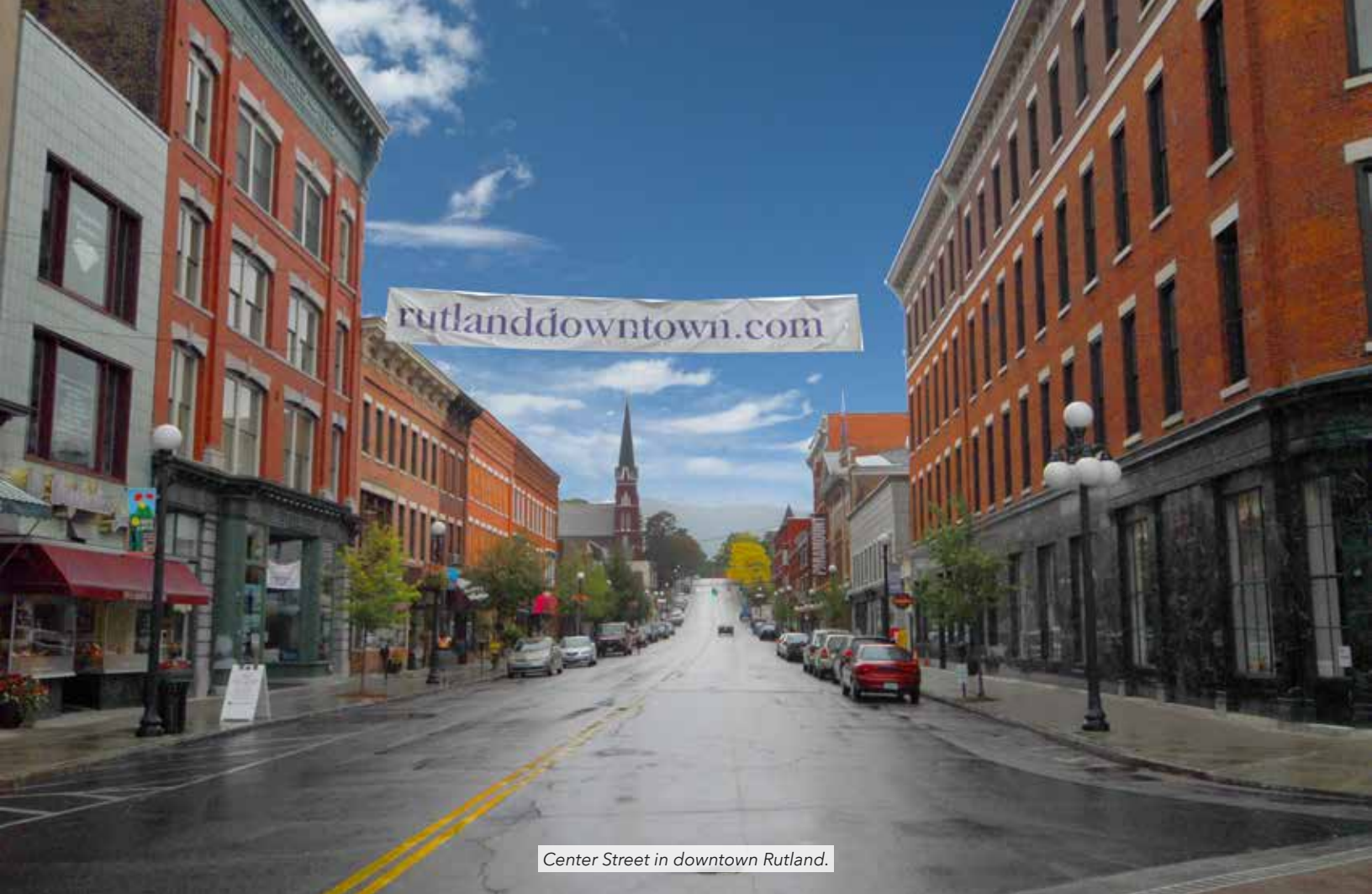
Center Street in downtown Rutland.