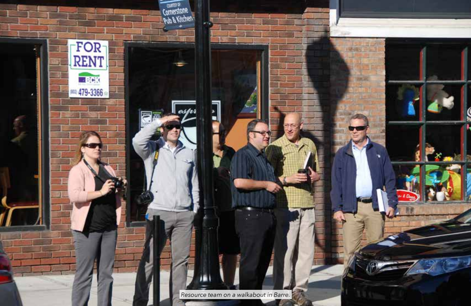
Resource team on a walkabout in Barre.