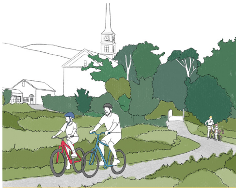
Walking and Biking Trails