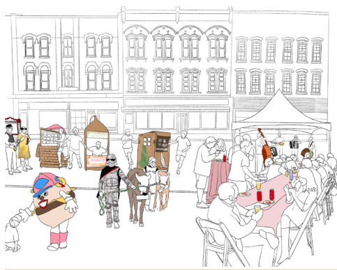
Downtown and Village Events