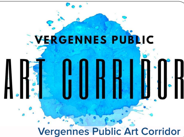
Vergennes Public Art Corridor