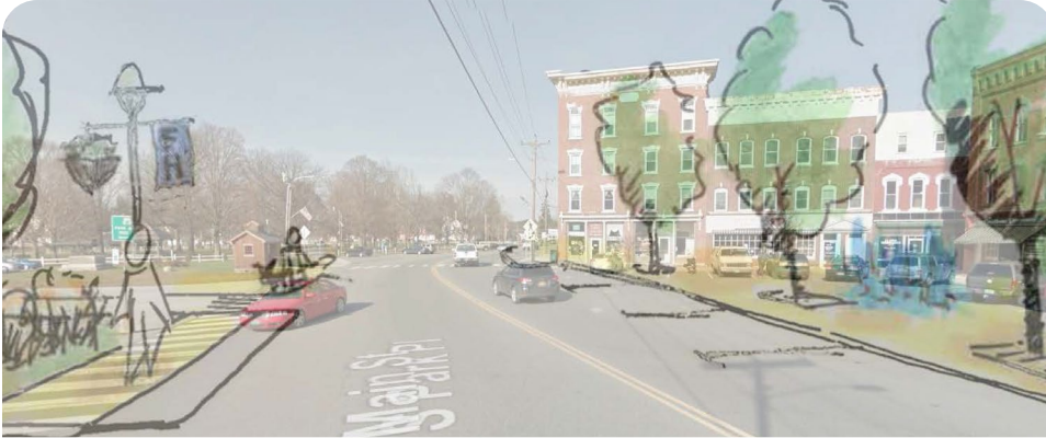
Fair Haven Downtown Streetscape Improvement Plan

Illustrated plans for specific locations galvanize public engagement around concrete changes and communicate with a broad range of people. The resulting visual plans and drawings help the community envision possibilities, align goals, and give the municipality useful leverage for obtaining public facility funding. The following projects, funded by Municipal Planning Grants, used simple illustrations to big effect.